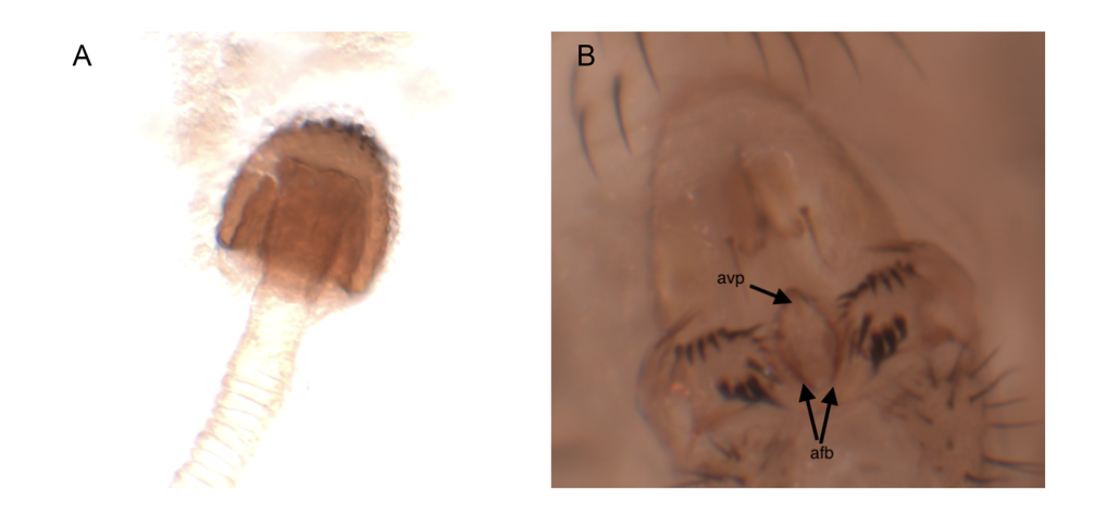
FIGURE 3 Detail of female spermatheca (A) and male aedeagus (B) of trapped individuals of Zaprionus tuberculatus (afb: aedeagal flap border; avp: aedeagal ventral process).

Zaprionus tuberculatus is widespread in Africa and the islands of the Indian Ocean (Madagascar, Comoro, Seychelles, Réunion and Mauritius) and Atlantic Ocean (St Helena and Cap Verde) (Chassagnard 1988; Chassagnard & Kraaijeveld 1991; Tsacas 1980; Tsacas et al. 1977; Yassin & David 2010). At the end of 20th century, Z. tuberculatus was recorded in Palearctic region from Canary Islands, Egypt, Cyprus, Malta and Israel (Chassagnard & Kraaijeveld 1991; Ebejer 2001). More recently, Z. tuberculatus occurred in Turkey (Patlar et al. 2012), Italy (Raspi et al. 2014), Romania (Chireceanu et al. 2015), Tunisia (Ben Halima Kamel et al. 2020) and Brazil (Cavalcanti et al. 2022).