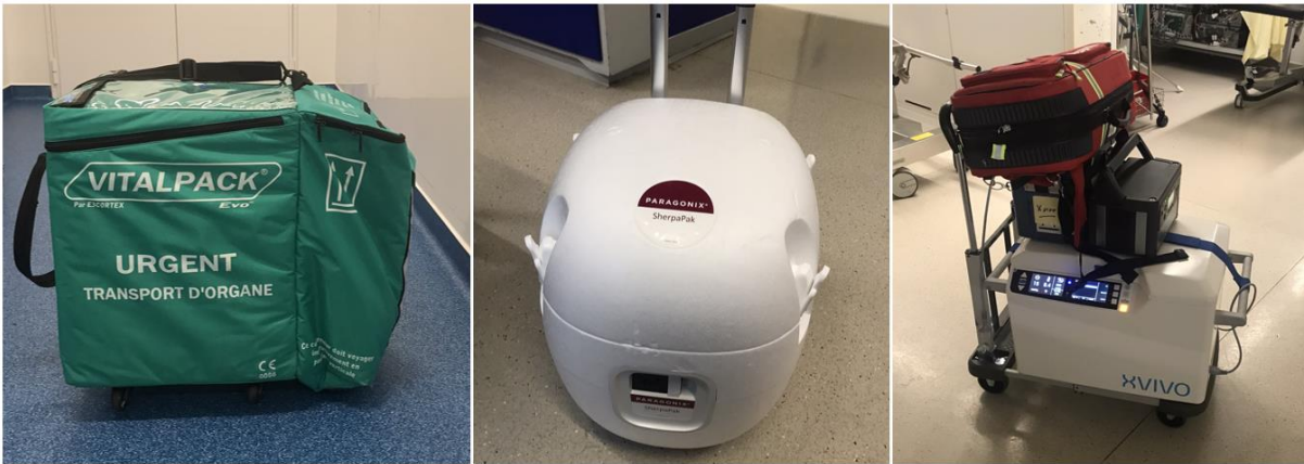
Figure 2. On the left the re-usable vitalpack ® icebox In the middle the Sherpapack, Paragonix ® icebox On the right the hypothermic perfusion machine Xvivo Perfusion, AB ®