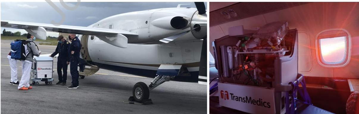
Figure 3. The normothermic perfusion machine Organ care system, OCS, Transmedics ®