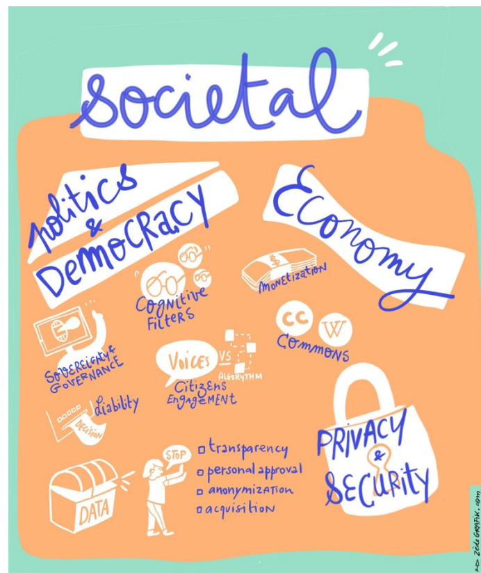
Figure 3: Societal challenges in Digital Technology in daily life

While the political and democratic challenges of digital technologies seem less obvious than the others, there are still extremely important. “Algorithms are political » said D. Cardon, a French sociologist (30). Political and democratic sub-challenges include sovereignty and governance, liability, cognitive filters, and citizen engagement (Figure 3).