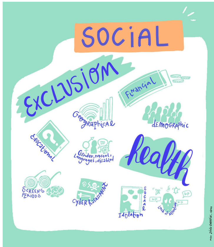
Figure 2 : Social challenges in Digital Technology in daily life

Financial exclusion is mainly related to the global cost of digital technologies including purchase, maintenance and use costs. While hardware (e.g., computers and cell phones) are becoming cheaper, they are still expensive for low-income individuals. Whereas, in some European countries, an internet subscription costs less than 10 USD per month, it costs more than 100 USD in some African countries and around 60 USD in North America. Knowing that several subscriptions may be needed for a single family, the budget for digital technologies is around 250USD per month in most western countries. This digital technologies related budget has been shown to be a concern for 14% of adults in the United States during the past few months of the COVID-19 outbreak (13), significantly influencing remote education in poorer populations. All in all, there is an important relationship between poverty and low level of digital technologies adoption (14).