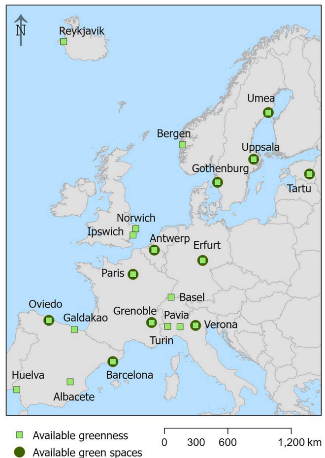
Fig. 1. Included study centers and availability of greenspace data across them.

FEV 1 and FVC repeatable to 150 mL from at least two of a maximum of five correct manoeuvres that met the recommendations of the American Thoracic Society and the European Respiratory Society (Miller et al., 2005) for repeatability, as well as the FEV 1 /FVC ratio, were used as the outcomes of interest. Four different models of spirometers were used across centers at ECRHS I and ECRHS II, while the same spirometer was used by all but two centers at ECRHS III (Table S1). Measurement bias due to the use of different spirometers had been corrected (Accordini et al., 2020; Bridevaux et al., 2015). All lung function measures were taken without bronchodilation.