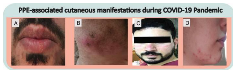
Figure 5. Documented cases of personal protective equipment (PPE) associated skin rashes during the pandemic; (A) Herpes simplex reactivation triggered by friction caused by wearing a surgical mask, (B) gown-related contact urticaria, (C) impressions on the face, (D) mask-related frictional acne. Adapted with permission from [75,86].