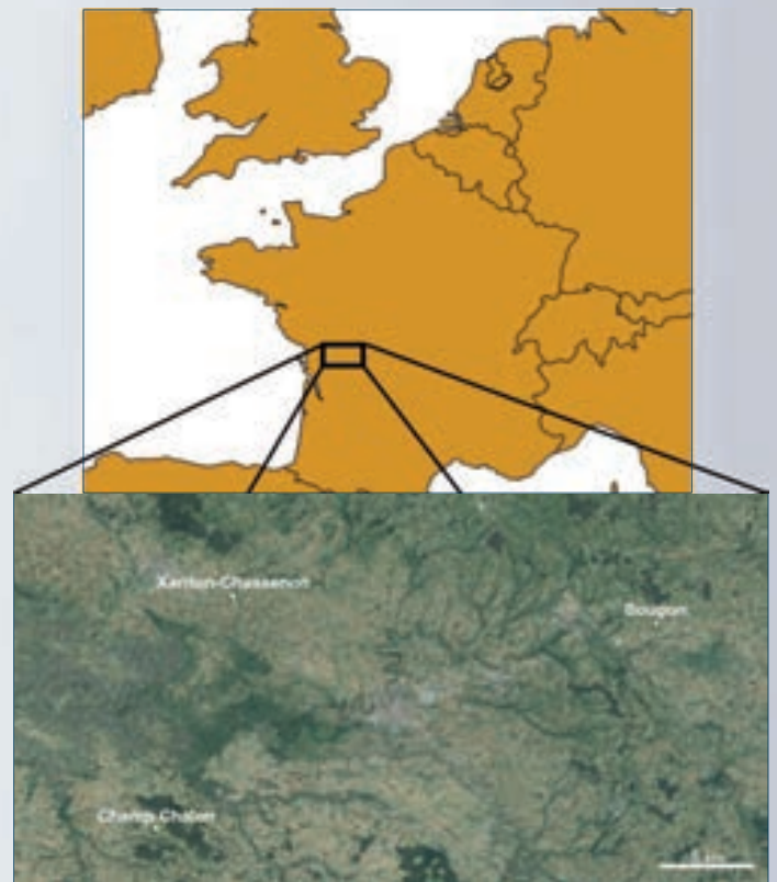
Fig. 1 – Location map of megalithic sites studied.

In this study, we sampled a large number of individuals from three Middle and Late Neolithic megalithic monuments from the French Atlantic façade (Fig. 1). Nine individuals were sampled from Bougon's tumulus F0. This Middle Neolithic structure with 14 C dates ranging from 4700-4000 BCE is one of a group of five tumuli containing the remains of hundreds of individuals. A further 33 individuals were sampled from the Middle Neolithic Champ-