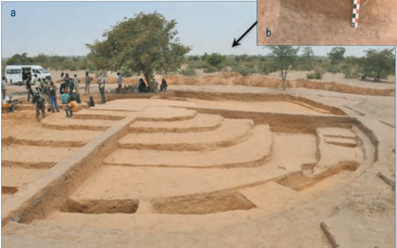
Fig. 5 – a. Monument of Soto during excavations and location of the spearhead (b); c. Geoarchaeological block samplings.