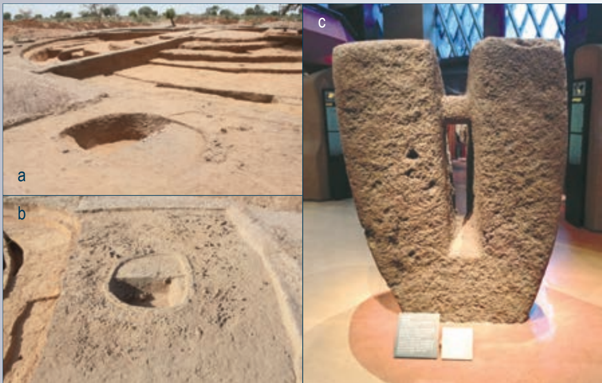
Fig. 6 – a, b. Ancient lyre-stone implantation pit associated with a protohistoric ground level; c. The Soto lyre-stone in the Musée du Quai Branly - Jacques Chirac in Paris, France.