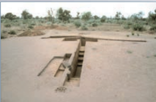
Fig. 1 – Earthen funerary tumulus with a frontal stone from Mbolop Tobé (Santhiou Kohel).

Since 2015, archaeological research carried out by Laporte and Bocoum on the site of Soto (Kaffrine region, Senegal) has offered new insights into the funerary tomb structures, known as Mbaanar which, until this work, were poorly studied (Fig. 3). These monuments are large pits filled by earthen mounds with a wide variety of architectures (Martin & Becker 1984). In the central-western region, some can reach several tens of metres in diameter, with a maximum height of 9 m (e.g., Wago Fall). Others form only discrete rises about 0.5 m high, barely perceptible in the landscape. Within the area of Senegambian megalithism, frontal stones erected on the eastern periphery sometimes complete the architectural device.