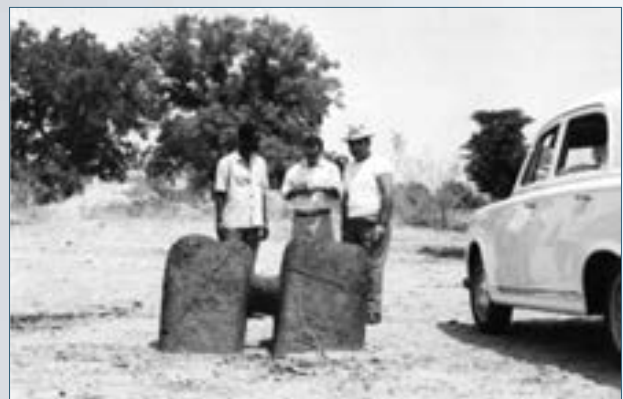
Fig. 2 – Lyre-stone in front of an earthen tumulus from Soto before its extraction (Credit: Archives Cyr Descamps).

In Soto, the bifid or ‘lyre’-stone originally erected on the eastern side of the monument was removed in 1966 (Fig. 2), as were two others at Djigui Tioker