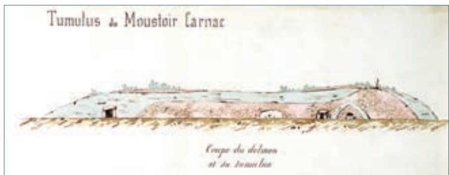
Fig. 1 – Section through the Tumulus de Moustoir, at Carnac (Morbihan). Watercolour by R. Pocard-Keviler du Cozlier, following excavations by René Galle (1864).

Combined and associated with the presence (or absence) of a covered entrance structure (portico or passage, either permanent or temporary), these different elements ultimately generated a series of standard features. These are easily identifiable in the arrangement of the blocks that form the framework of the funerary chambers in which the dead were henceforth deposited, not below ground but on the same level as the daily activities of the living (Joussaume 2003, 2016). It is the ruins of these monuments that form the basis of the entire descriptive vocabulary associated with them, and of the system of classification still in use today in