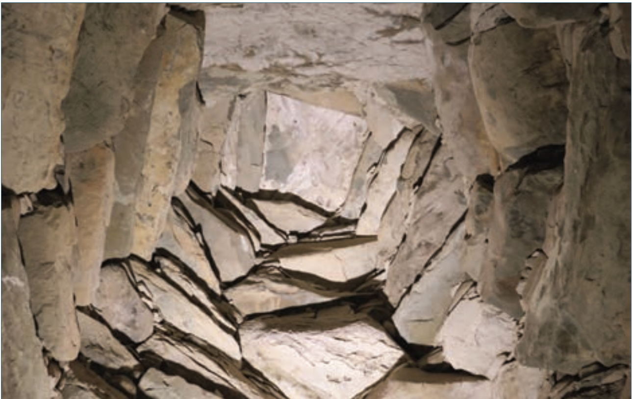
Fig. 6 – The corbelled vault covering the central chamber at Newgrange, Ireland.

In the Irish Sea province and northern Scotland, the late 4th millennium is the period of the developed passage tombs. The largest and most striking examples are those of the Boyne Valley, notably Knowth and Newgrange, with their corbel-vaulted chambers and extensive repertoires of megalithic art. At Newgrange, a 15 m-long passage leads to the central chamber, of cruciform plan, covered by a corbelled vault rising 6 m above the chamber floor ( Fig. 6 ).