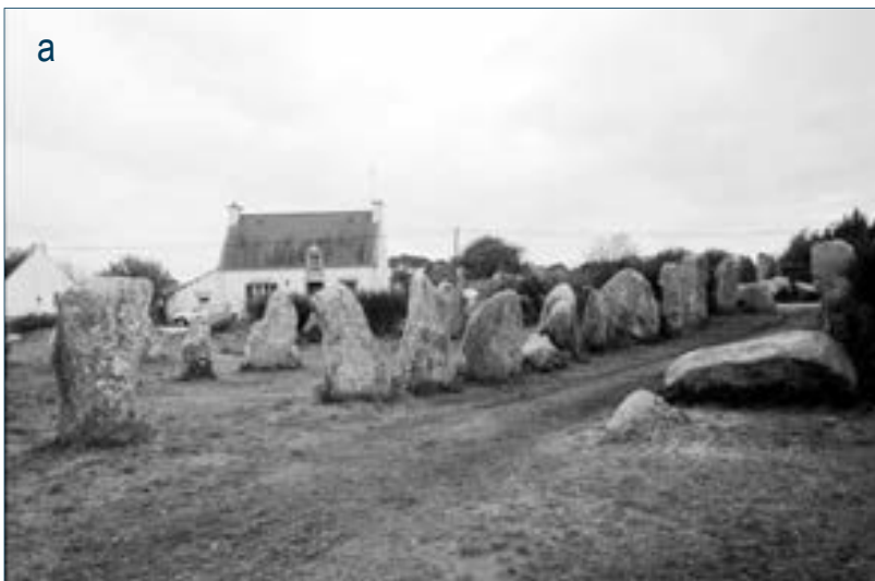
Fig. 2 – a. The stone alignments of Kerzerho at Erdeven (Morbihan); b. The menhir of Champs Dolent at Dol-de-Bretagne (Ille-et-Vilaine).

In western and northern France, the term ‘passage tomb’ covers a diverse set of architectures without close parallel in Britain and Ireland, or northern Europe more generally. Some chambers of entirely dry-stone construction above ground and buried under a mound enclose a space similar to that of a silo: a grain store for the dead (Laporte et al. 2011: 299). Others built solely of large blocks of stone take the form of a large cist (Fig. 3). Between these two extremes, numerous other forms are found which vary in the provision of an access. In Brittany, as well as in Normandy and on the plains of west-central France, there exist small circular cairns tightly wrapped around a circular chamber accessed via a very short passage. Some of these were later incorporated into much larger and more complex monuments, sometimes including several burial chambers (Scarre et al. 2003; Jousaume & Laporte 2006). These circular chambers are generally roofed