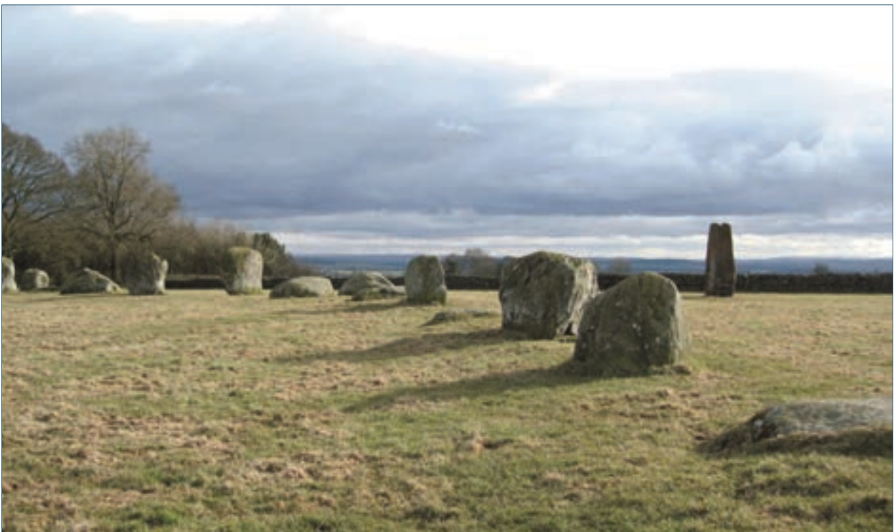
Fig. 8 – Long Meg and Her Daughters in northwest England. The red sandstone pillar of Long Meg (right) standing outside the stone circle of glacially rounded boulders (her ‘Daughters’).

The stone circles have their own parallels in timber monuments, mostly today of course represented merely by patterns of postholes. They are found in areas where stone circles are absent, but in some cases, there is evidence that a timber circle preceded a stone circle in the same location. Dating evidence indicates that the timber circles were being built in the final centuries of the 4th millennium BC; the first stone circles may belong to the same period. The timber-stone connection achieves its most dramatic expression at Stonehenge in central southern