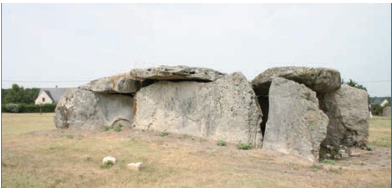
Fig. 4 – The dolmen angevin of La Madeleine at Gennes (Maine-et-Loire) (Photo: L. Laporte).