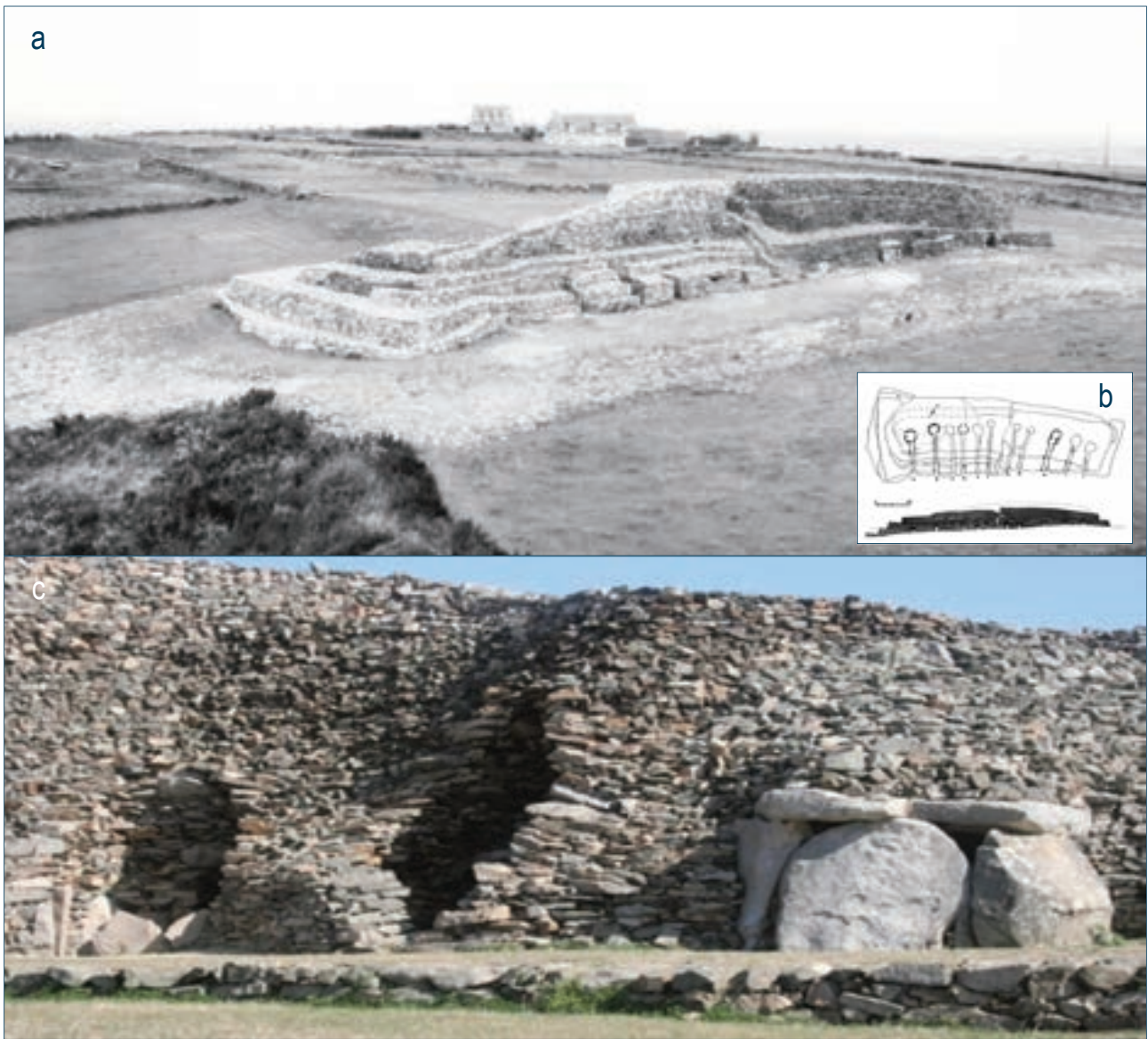
Fig. 3 – ‘ Tombes à couloir ’ within the monument of Barnenez, some roofed by a capstone, others by a corbelled vault (a: Archives du Laboratoire Archéosciences; b: after Giot 1987; c: photo: L. Laporte).