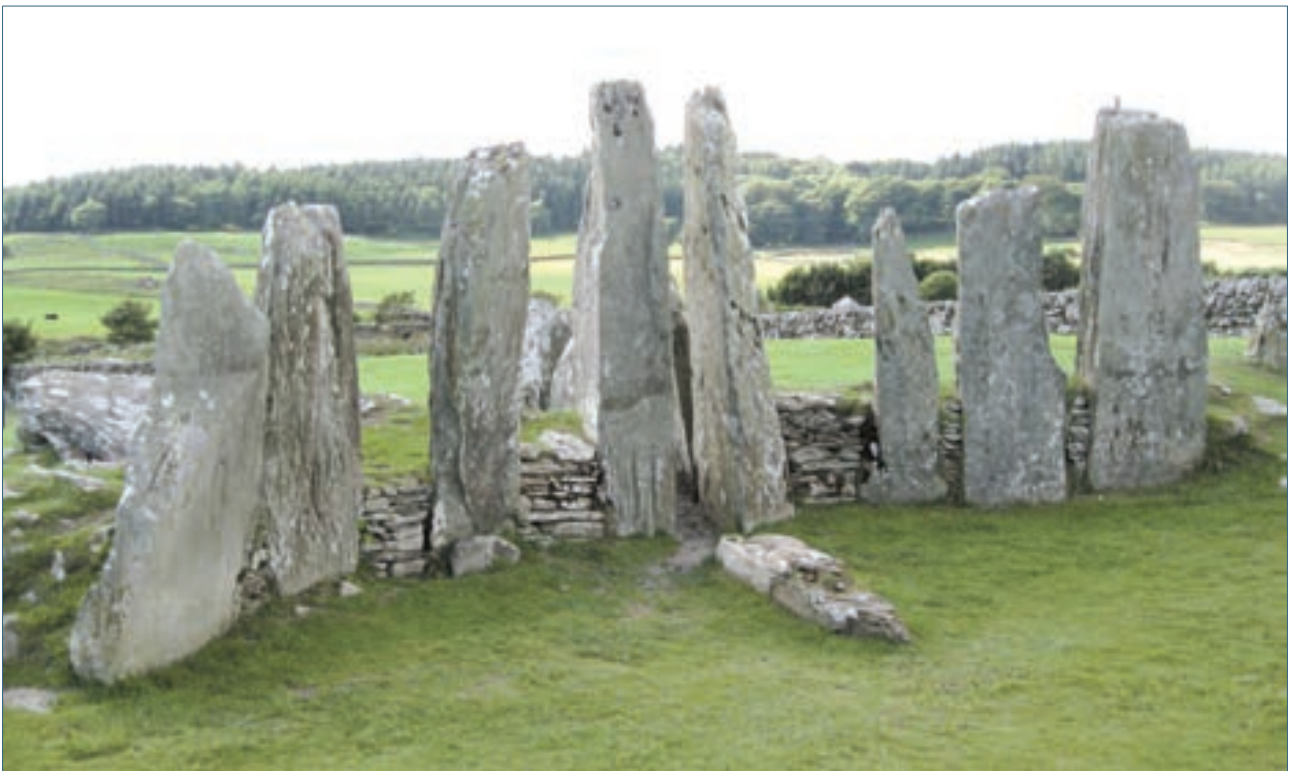
Fig. 5 – The Clyde tomb of Cairnholy in southwest Scotland, showing the concave façade with tall monolithic pillars (Photo: C. Scarre).

Court cairns and Clyde cairns were at one stage assigned to a single ‘Clyde-Carlingford’ group but are now regarded as separate, although closely related, forms. One key distinction is the form of the mound or cairn in which they were incorporated. In Scotland, elongated or trapezoidal cairns are the usual form, with inwardly curved entrance façades sometimes enhanced by thin pillar-like columns (Fig. 5). In Ireland, conversely, the deep, inwardly curved entrance façades are sometimes extended to form an enclosed courtyard, with a narrow entrance passage facing towards the chamber (as for example