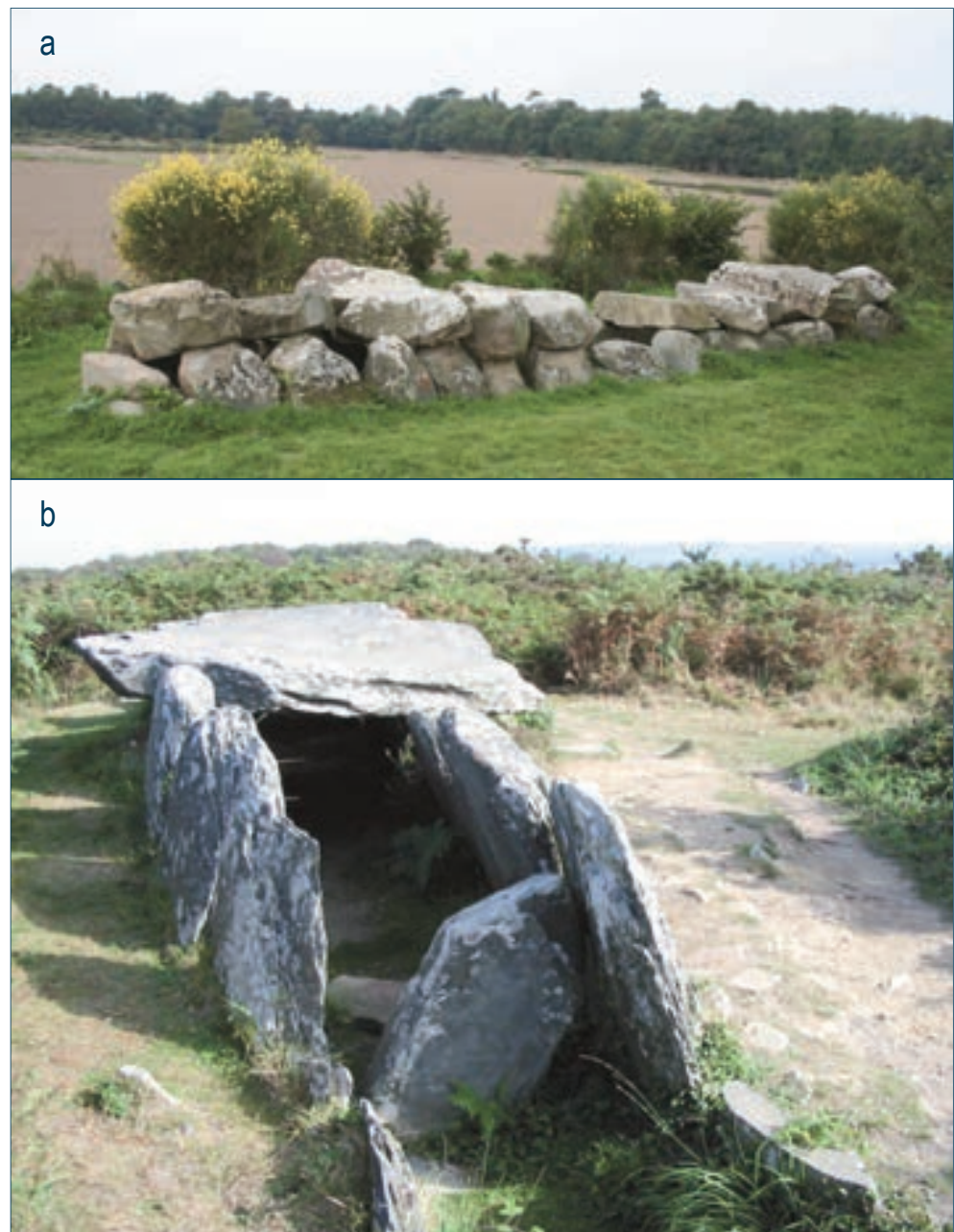
Fig. 9 – Allées couvertes , with a short lateral passage (a) Le Mélus, Côtes-d'Armor, or an axial entrance (b) Liscuis II, Côtes-d'Armor (Photos: L. Laporte).

or antechamber: commonly referred to as allées couvertes or allées sépulcrales ), or in one of the long sides, accessed via a passage at right angles to the main chamber ( sépultures à entrée latérale ). In northwestern France, these tombs mark the renewal of megalithic tomb construction, but the prevalence of acidic soils makes the associated burial practices difficult to reconstruct (Giot et al. 1998). Allées sépulcrales are also found in the Paris basin and northwards towards the Channel coast, where chalk and limestone geology have allowed excellent preservation of human remains. Careful excavation and detailed analysis at sites such as La Chaussée-