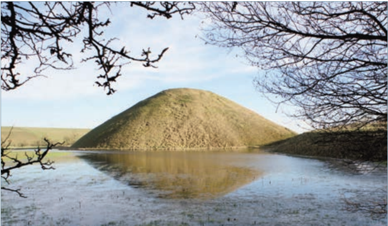
Fig. 10 – Silbury Hill at Avebury in southern England, the largest prehistoric mound in western Europe, showing the flooded quarry pit in the foreground.

We are grateful to Mike Pitts for supplying the image of Silbury Hill (Fig. 10).