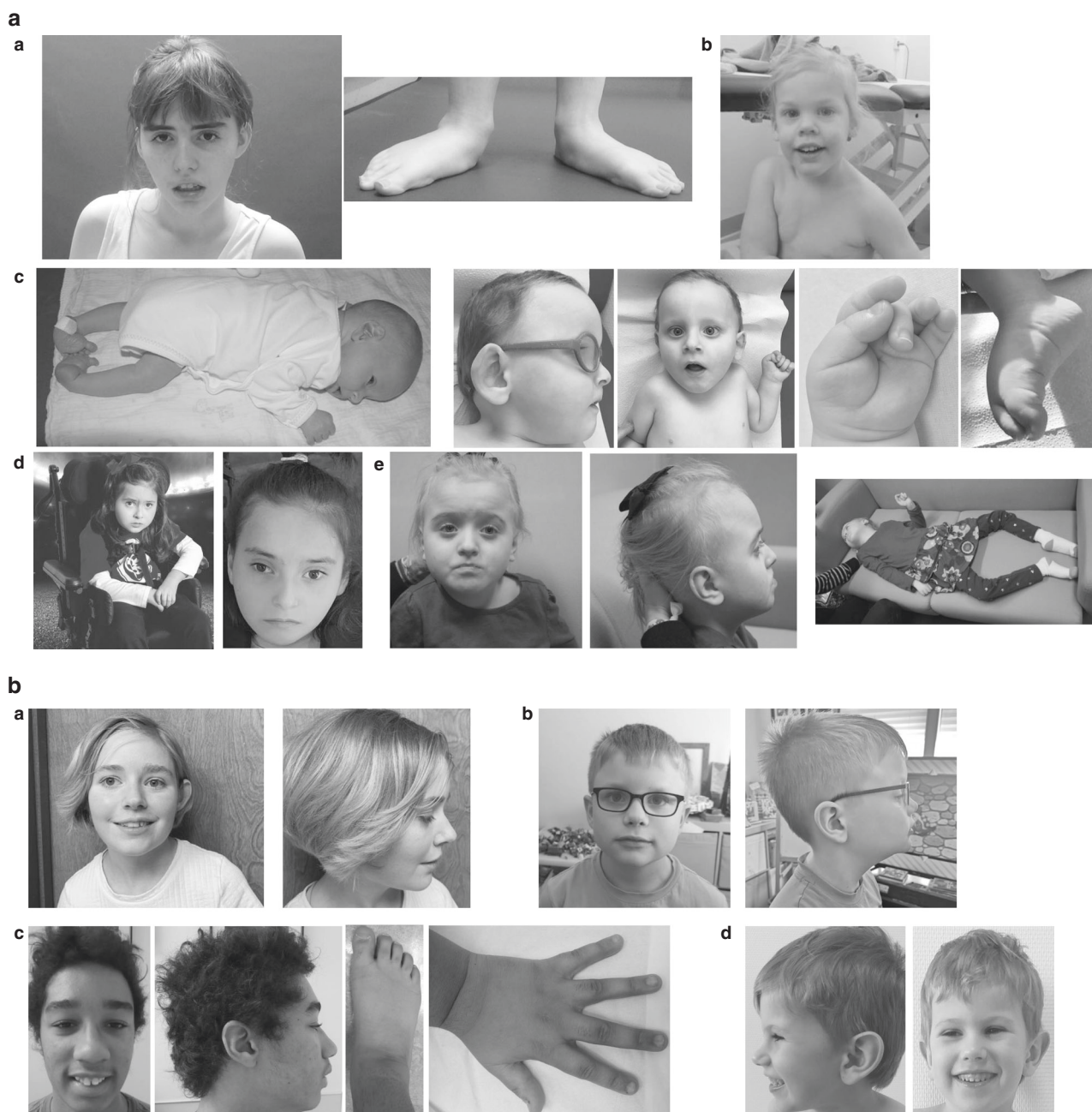
Fig. 1 Dysmorphology seen in individuals with CACNA1C variants. (a) Spectrum of dysmorphology seen in individuals with CACNA1C nontruncating variants. (a) Individual P1 at age 23 years. Note pes planovalgus. (b) Individual P5 at age 4 years. (c) Individual P10. Note clubfoot in infancy, and small appearing feet with prominent heels, adducted thumb, and camptodactyly later in childhood. (d) Individual P12 at age 6 years of age. Note strabismus and kyphoscoliosis. (e) Individual 13 at age 6 years old. (b) Spectrum of dysmorphology seen in individuals with CACNA1C truncating variants. (a) Individual 15 at 15 years old. (b) Individual 16a at 6 years old. Note large ears. (c) Individual P18. Note mildly broad thumbs, hypoplastic 5th fingernails, broad halluces, and hypoplastic fifth toes. (d) Individual P19 at age.