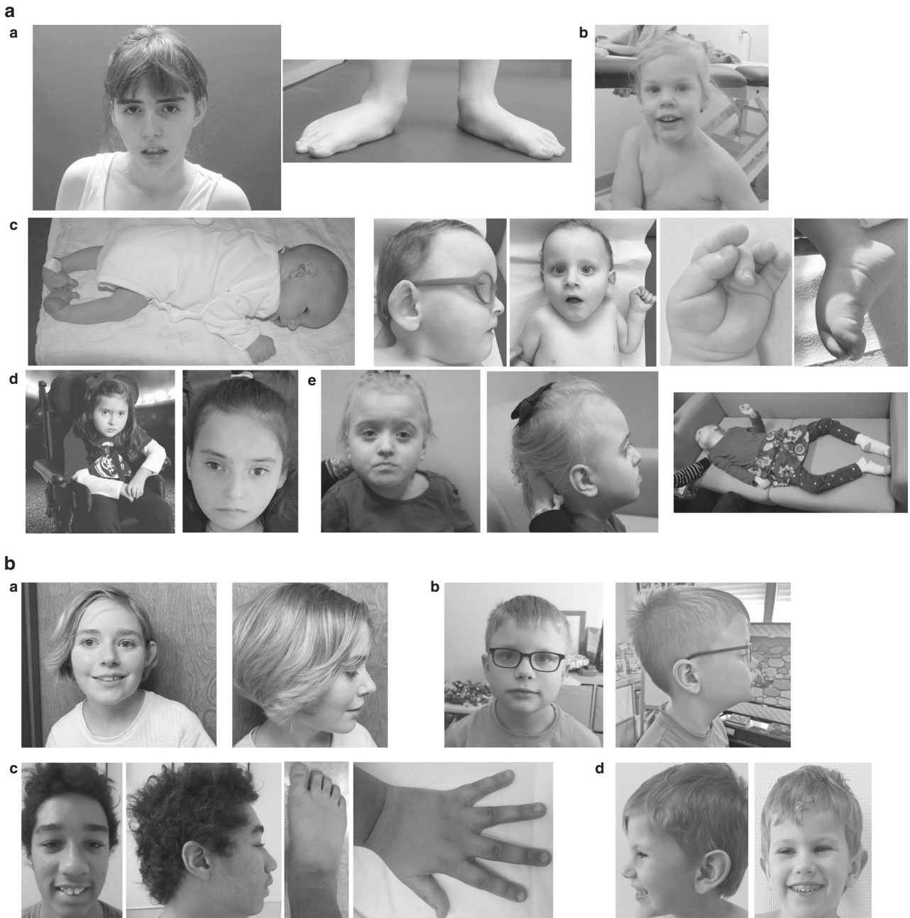
Fig. 1 Dismorphology seen in individuals with CACNA1C variants. (a) Spectrum of dysmorphology seen in individuals with CACNA1C nontruncating variants. (a) Individual P1 at age 23 years. Note pes planovalgus. (b) Individual P5 at age 4 years. (c) Individual P10. Note clubfoot in infancy, and small appearing feet with prominent heels, adducted thumb, and camptodactyly later in childhood. (d) Individual P12 at age 6 years of age. Note strabismus and kyphoscoliosis. (e) Individual 13 at age 6 years old. (b) Spectrum of dysmorphology seen in individuals with CACNA1C truncating variants. (a) Individual 15 at 15 years old. (b) Individual 16a at 6 years old. Note large ears. (c) Individual P18. Note mildly broad thumbs, hypoplastic 5th fingernails, broad halluces, and hypoplastic fifth toes. (d) Individual P19 at age.