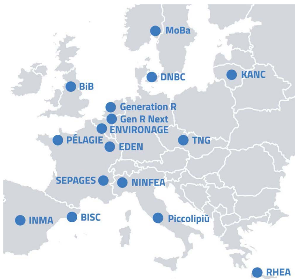
Figure 2. Cohorts participating in ATHLETE. BiSC indicates Barcelona Life Study Cohort; DNBC, Danish National Birth Cohort; EDEN, Etude des Déterminants pré et postnatals du développement et de la santé de l'Enfant; ENVIRONAGE, environmental influence on early ageing; INMA, Infancia y Medio Ambiente; KANC, Kaunas Cohort; MoBa, Norwegian Mother and Child Cohort Study; NINFEA, Nascita e Infanzia: gli Effetti dell'Ambiente; PELAGIE, Perturbateurs Endocriniens: Étude Longitudinale sur les Anomalies de la Grossesse, l'Infertilité et l'Enfance; RHEA, Crete Mother Child Cohort; SEPAGES, Suivi de l'Exposition à la Pollution Atmosphérique durant la Grossesse et Effets sur la Santé; TNG, CELSPAC The Next Generation cohort.

recently established, state-of-the-art birth cohorts that are highly suitable for exposome research: Suivi de l'Exposition à la Pollution Atmosphérique durant la Grossesse et Effets sur la Santé (SEPAGES) in France, 59 environmental influence on early ageing (ENVIRONAGE) in Belgium, 60 Generation R Next in the Netherlands, Barcelona Life Study Cohort (BiSC) in Spain ( https://www.projectebisc.org ), Piccolipiù in Italy, 61 and CELSPAC-The Next Generation (TNG) in the Czech Republic. The inclusion of new cohorts is important for (1) their improved sampling strategies for exposure assessment, in particular the collection of many repeated urine samples during pregnancy (BiSC and SEPAGES), personal monitoring (BiSC and SEPAGES), and placenta sampling (BiSC, SEPAGES, ENVIRONAGE) and (2) their cutting-edge outcome assessments, including imaging techniques, to study organ and placenta development (BiSC, Generation R Next). The inclusion of new exposome cohorts also allows the evaluation of new chemicals that are now produced in high volumes but that are not detectable in biosamples collected during pregnancy in older cohorts even 10 years ago (e.g., new bisphenols).