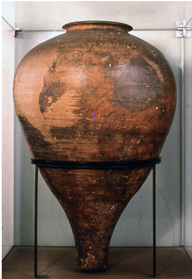
FIGURE 25.1. National Museum, New Delhi. An onion-shaped jar from Harappa, a most common large transport vessel in the Indus Civilization, of the same type as the inscribed one found at RJ-2. They made very resistant, waterproof containers, designed to fit the sharp curvilinear profile of the hull of boats, as were Roman amphorae.

The fact that black slipped jars were produced in a specific region, the Indus basin, and were clearly intended for long distance trade, indicates that they