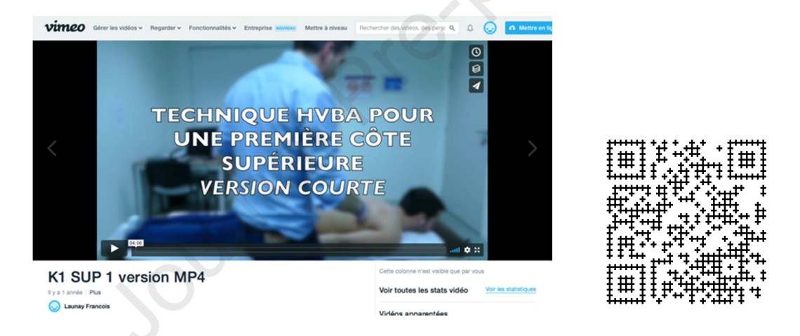
Figure 2. Extract of one of the videos used for the study, with the corresponding QR code on the right.

The video support material consisted of 5 videos produced in December 2017 at the Institut d'Ostéopathie de Rennes - Bretagne. These five videos illustrated five high-velocity, low-amplitude (HVLA) techniques that were taught at the Institute within the same course unit. These techniques were introduced for the first time in the second year of study and required a second-year student level of technical competence. The videos were recorded using a smartphone (Iphone® 5S), a digital camera (Panasonic Lumix® FZ1000) and a lapel microphone (Boya®). The recordings were posted online on a Vimeo® private access video sharing platform. A sample video used for the study can be viewed by scanning the following QR code (Figure 2).