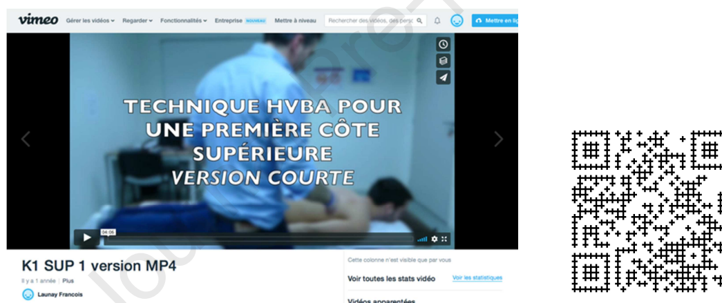
Figure 2. Extract of one of the videos used for the study, with the corresponding QR code on the right.

The video support material consisted of 5 videos produced in December 2017 at the Institut d'Ostéopathie de Rennes - Bretagne. These five videos illustrated five high-velocity, low-amplitude (HVLA) techniques that were taught at the Institute within the same course unit. These techniques were introduced for the first time in the second year of study and required a second-year student level of technical competence. The videos were recorded using a smartphone (Iphone® 5S), a digital camera (Panasonic Lumix® FZ1000) and a lapel microphone (Boya®). The recordings were posted online on a Vimeo® private access video sharing platform. A sample video used for the study can be viewed by scanning the following QR code (Figure 2).