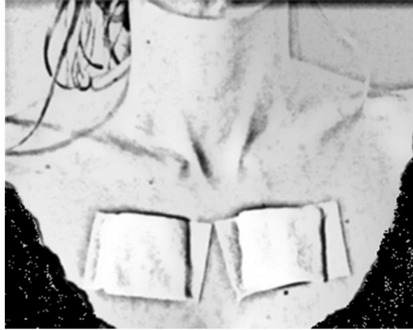
433 Fig. 1. Position of gauzes on a mother's upper chest to collect body odors