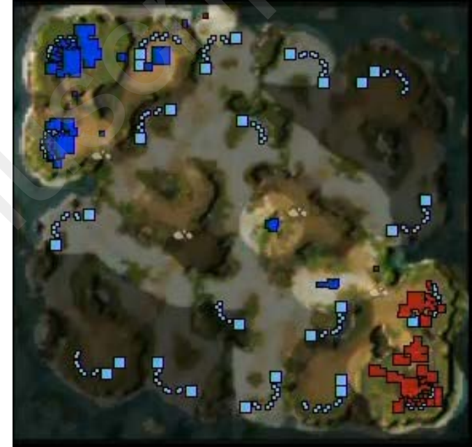
Figure I. Mini-map of a standard game of StarCraft II.

The classic confrontation type in StarCraft II, as played by AlphaStar, consists of two players confronting each other in a particular environment with limited resources – see the "mini-map" (Figure I). This represents an ecological competition between two individuals, which can be intra or interspecific, depending on whether the players choose the same race. The map shows the entire environment, but the players' vision is limited to the lighter, circular zones around their respective units and buildings. Resources are the light blue shapes, and the dark blue and red shapes are the buildings and units of both players (Protoss in blue, Terran in red). The progress and outcome of competition can be monitored through this mini-map, which shows colonization and exploitation of new resource patches, environment exploration, and often, ecological collapse. This map could be used to monitor more realistic ecological models. For instance, several players could compete against each other in a larger and entirely unpredictable environment, which would enable the study of ecological processes at the scale of populations and communities. We could also set up scenarios in which we artificially modify environmental conditions during the game, and then evaluate the consequences on ecosystem functioning and biodiversity dynamics. Note that quantification of several ecological processes like trait changes or trade-off modification are easily feasible with the game parameters.