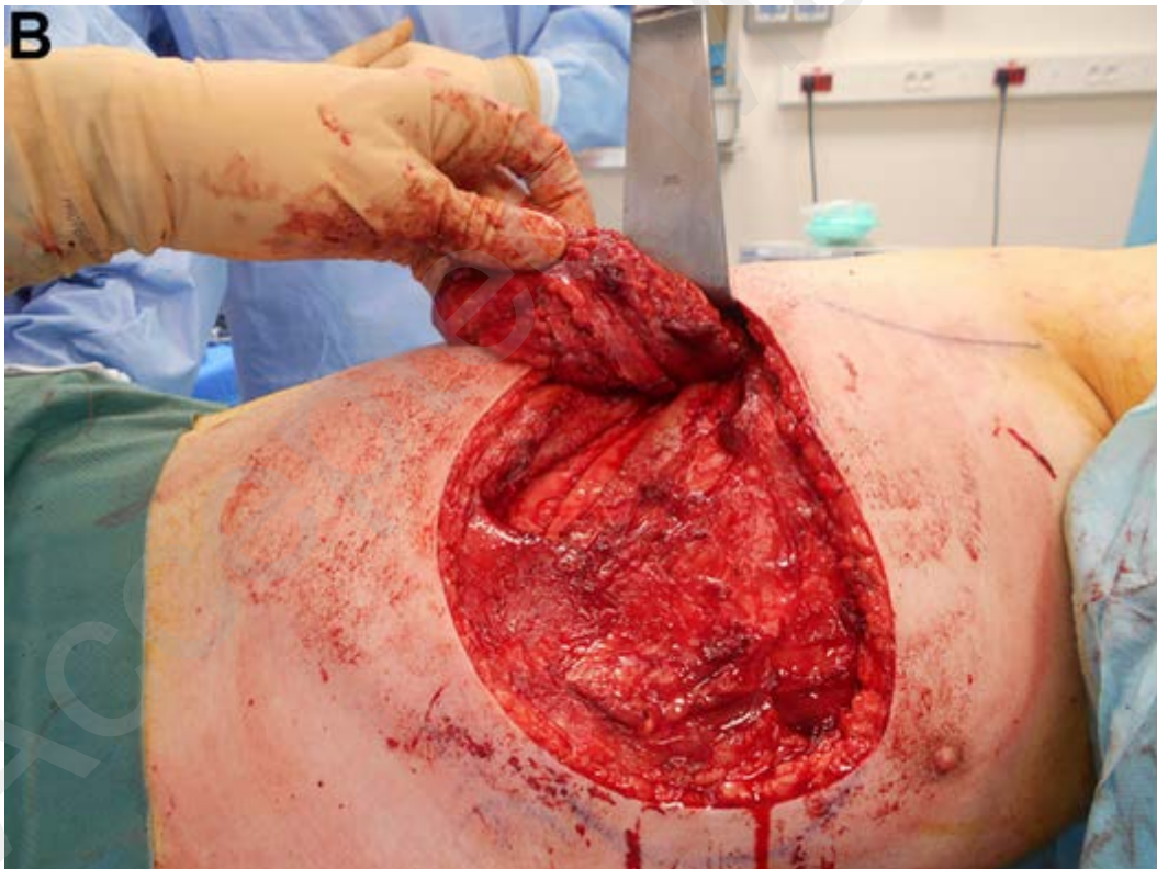
Fig 3: The flap at the end of surgery. Posterior cervical and chest view in left lateral decubitus.