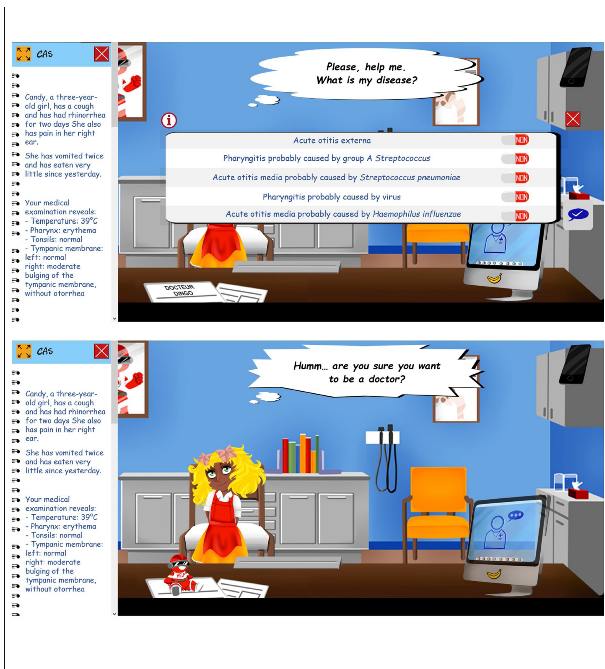
Fig. 2. AntibioGame® gameplay. At the beginning of the game, the patient record is displayed on the left. The patient asks the medical student a question, and the student responds by selecting one or more of the responses displayed (upper panel). Once students have validated their answers, they can read the patient's comment, which may be pleasant or sarcastic, depending on the accuracy of the answer. In the lower panel, the patient gives a sarcastic comment because the answer given was incorrect. Students can request hints by clicking on the "help" icon on the left of the desk.