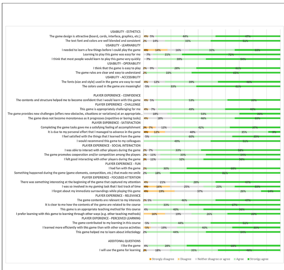
Fig. 4. Usability and playability of AntibioGame®. Graphical results. (For interpretation of the references to colour in this figure legend, the reader is referred to the web version of this article).