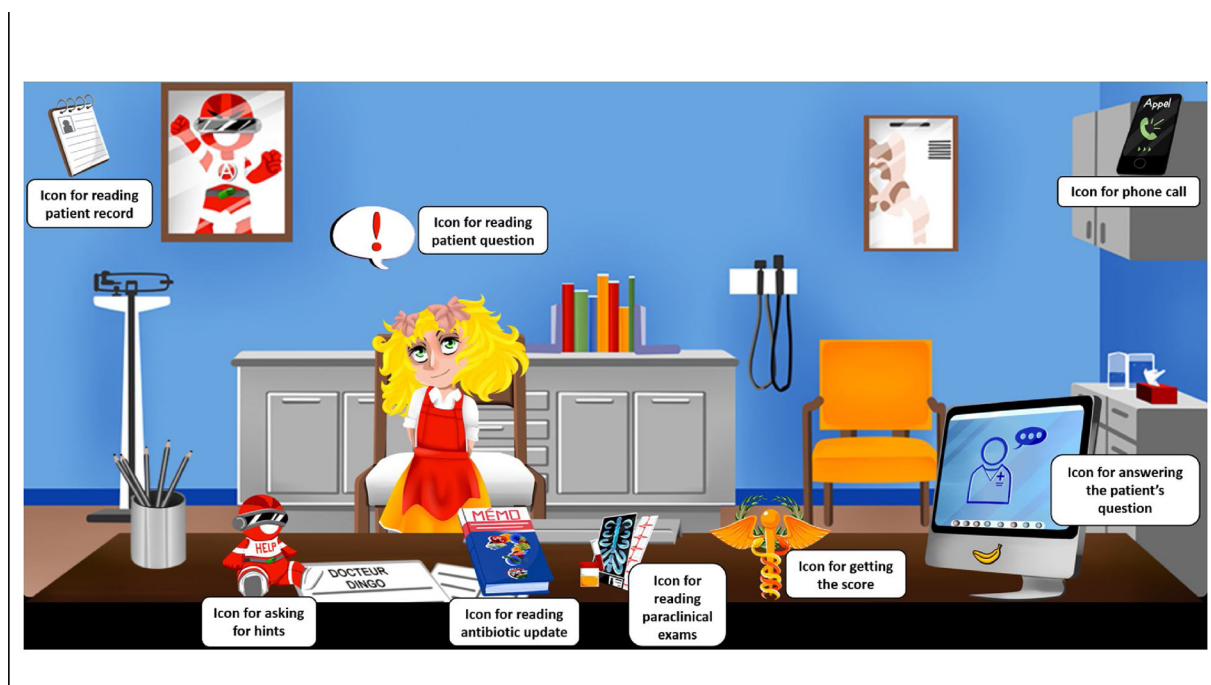
Fig. 1. AntibioGame® interface. Here, a little girl, “Candy”, has come to consult her GP. Various interactive and meaningful icons are displayed through the interface.

students questions and respond enthusiastically or sarcastically, depending on the correctness of the answers supplied by the students. The decor corresponds to various medical contexts, and various meaningful icons are used (Fig. 1).