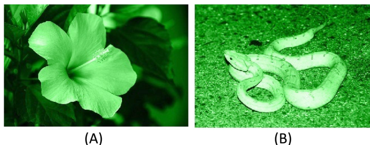
Fig. 1 Examples of the stimuli used in the experiment. a image of flower in green and b image of snake in green. Both photos were taken by one of the authors of the current report

No experiment began without assuring that the participants had understood the instructions given. To assure this, the parents of the children with ASD were asked to