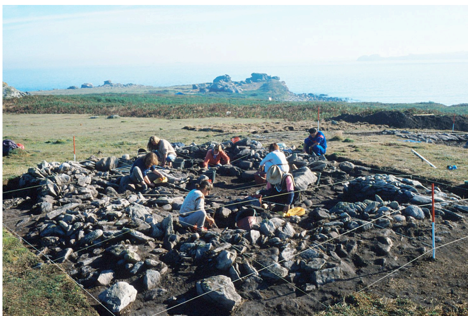
Figure 6: Excavation in progress on Yoc'h Island (1987-1990), Iron Age village.

Today, the AMARAI association has about 80 members, including professional researchers not only in archaeology but also in other domains (geography, history, biology), as well as volunteers, islanders and island lovers interested in cultural heritage. The diverse backgrounds of its members is a strength, since, thanks to their complementary skills (academic and non-academic), AMARAI provides a favourable test bed for multi-disciplinary approaches. Moreover, many of the volunteers are closer to the field than researchers in academic posts. Indeed, several non-academic members have discovered archaeological sites or keep watch on vulnerable remains, striding along many kilometres of cliff paths and beaches after each storm. I would like to stress that the participation of local volunteers in such research projects appears fundamental, even if modern archaeology is supposed to be more and more professional. The efficiency of such cooperation will be pointed out through the results presented below.