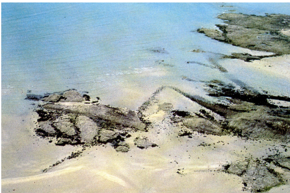
Figure 7: Ancient fish traps, Saint-Jacut-de-la-Mer (photo by L. Langouët).

We can give some quantitative data to illustrate the efficiency of systematic survey campaigns. On Groix island, the first desk-based inventory mentioned a high archaeological potential of 35 sites, especially megaliths distributed over the 1520 hectares of the island. Following two fieldwork surveys of one month each, carried out with a team of three to seven persons, the dataset lists more than 150 archaeological sites or deposits, dating from the Palaeolithic period up to Modern times. While the Neolithic period has long been known on this island (see above), some of the cultural or chronological evidence needs to be revised. This research provides totally new information, on the one hand concerning the early Prehistoric population of the island (especially late Palaeolithic) and, on the other hand, the Roman period. From 2003 to 2006, four expeditions (of three weeks duration each) were mounted that allowed a group of four specialists and six students to obtain more detailed data on some sites (Molines et al., 2004). The Ushant Heritage inventory, carried out in 1990-1991, was also a collaborative study involving 6-8 persons, spending two months in the field. The starting point of the inventory was the mention of 8 archaeological sites, while, as a “final” result, the dataset listed 105 archaeological sites or deposits, unequally distributed over the 1558 hectares of the island (Robic [ed], 1992).