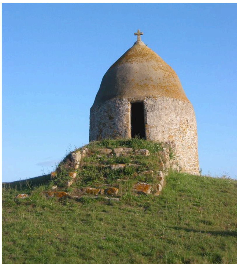
Figure 8: Early medieval chapel on the Modez Island (photo by M.Y. Daire).

colonisation, migration, abandonment, resettlement, trade and exchange” (Dawson, 2008: 19). Question of islands heritage management have to deal not only with the archaeological record but also with sustainability, vulnerability, and cultural identity, which is why interdisciplinary projects, such as the AMARAI Association, are so relevant.