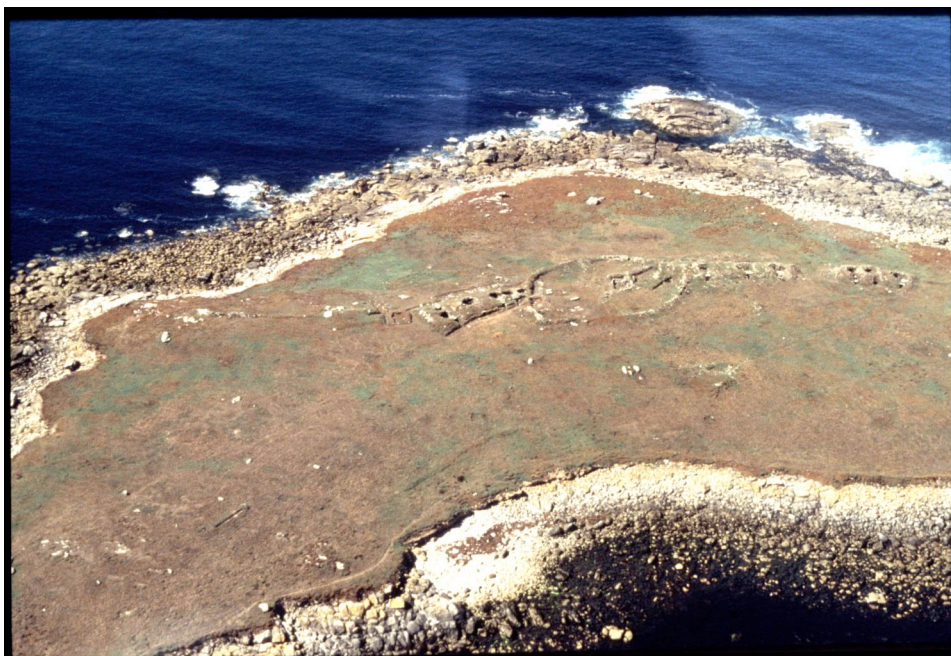
Figure 5: Aerial view of the megalithic burials and Gaulish settlement on Guennoc Island.