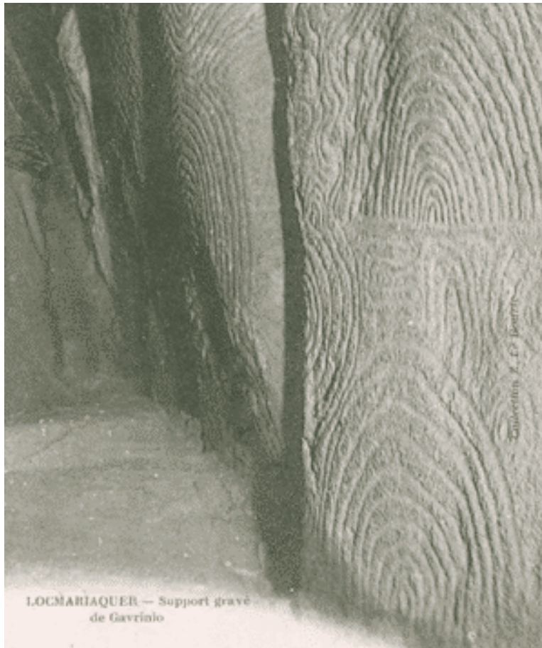
Figure 2: Gavrinis island: passage grave drawings (postcard from the early 20th Century).

set foot there. Strabo and Pomponius Mela (1st Century AD) mentioned another island (probably Sena Island) in the vicinity of Brittany, where religious ceremonies were held in honour of Demeter and the goddess Koré, according to rites comparable to those performed at Samothrace temples; the priestesses were said to be hugely powerful, able to raise tempests by their incantations, to transform themselves into animals, to cure incurable diseases, and to tell the future.