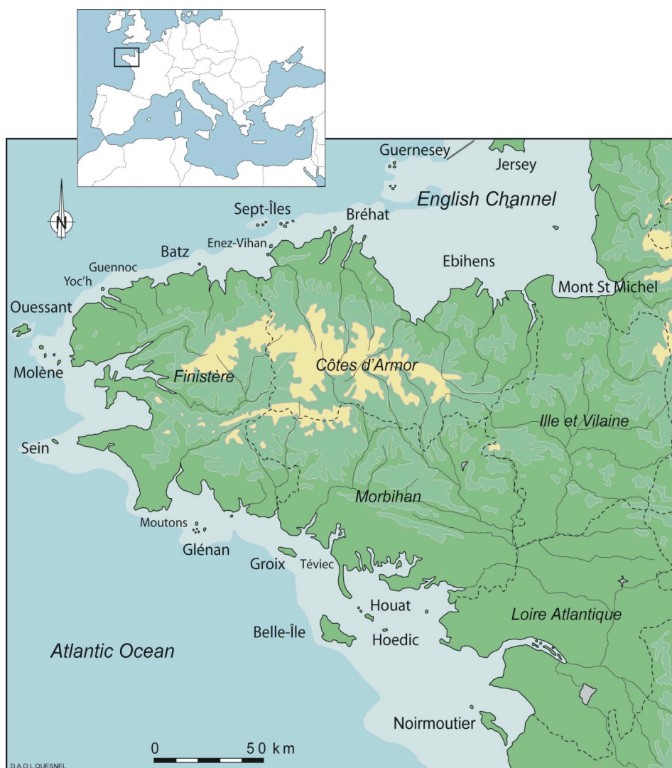
Figure 1: Location maps of the study area and the main sites mentioned in the text (Map by M.Y. Daire and L. Quesnel).

less than 1 hectare. Since they are only separated from the mainland by some hundreds of metres, they can be regarded as “temporary” or “satellite” islands, cut off only by the high tide but more or less accessible at low tide (Brigand, 2002).