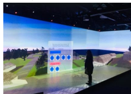
Figure 2. Test of the 3D model of the Intendence's palace in an immersive room.

Next, we added the elements directly into the virtual software Unity and chose the materials/textures for each of them. Aiming for an efficient yet realistic context, the computer researchers integrated a skybox to allow a change from day to night and back again. For navigation, the "ghost" mode was preferred, as it gives more possibilities of movement for the user to go in any direction without gravity. A main menu was created to explain the project and the controls and to allow the user to choose between an Edition mode (tr. edit mode) and a visualization mode of the initial hypothesis (Figure 2).