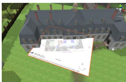
Figure 3. Archaeological excavation survey of 2009, which located the foundations of the staircase, inside the 3D virtual environment.

In this immersive environment that we created, the archaeologist was able to integrate archaeological excavations, surveys, historical maps and architectural plans related to the period of study (Figure 3).