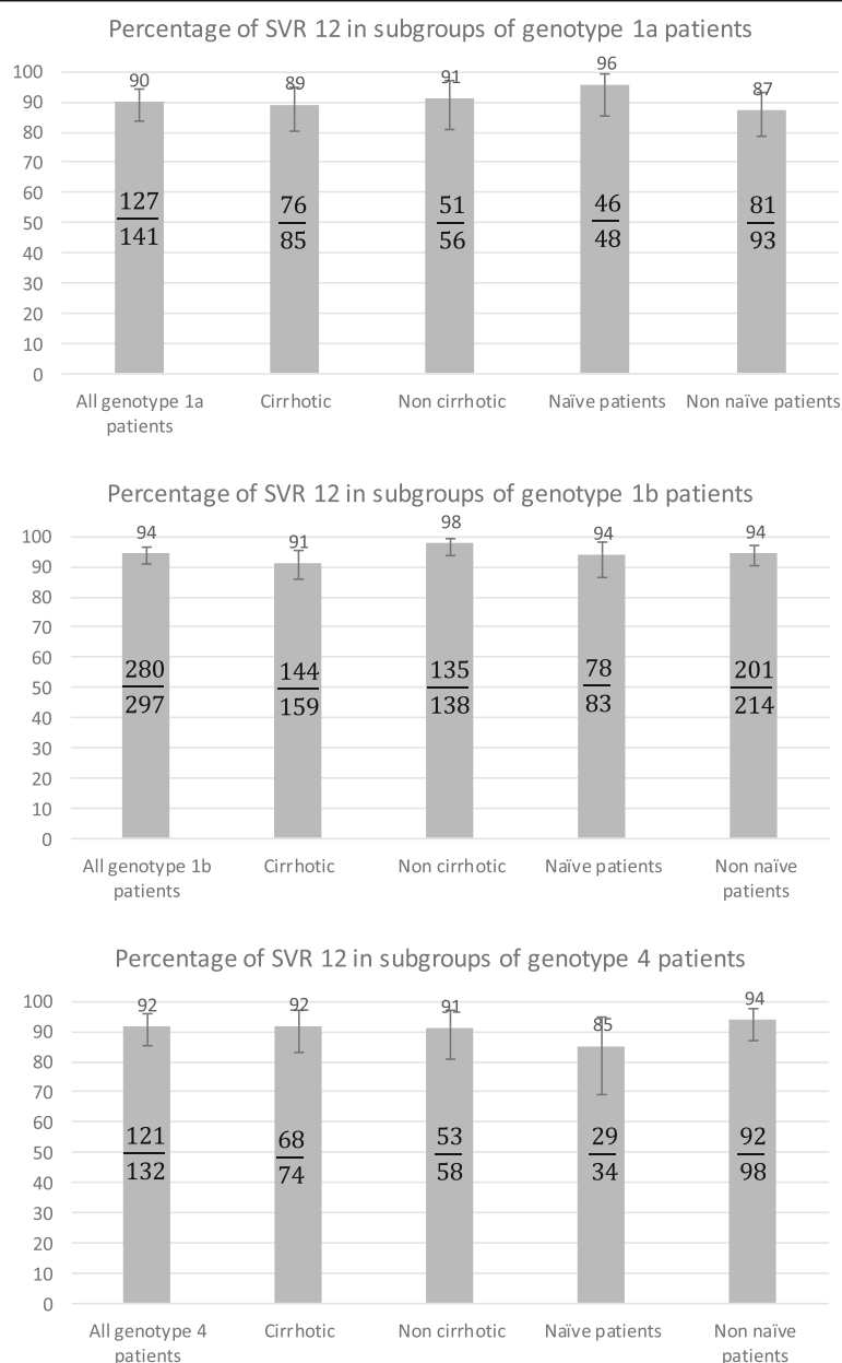
Fig. 2 Percentages of SVR12 in subgroups of patients by genotype

geographical areas or other genotypes are limited. In this real-life study, we analyzed the efficacy and safety of the sofosbuvir+simeprevir +/- ribavirin combination in patients with genotypes 1 or 4 infection from the French ANRS CO22 HEPATHER cohort, a real-life study. Most of these patients were “difficult-to-treat” since 56% had cirrhosis, 4% had decompensated cirrhosis, 71% had failed prior treatment with pegylated interferon and ribavirin and 5% associated with telaprevir or boceprevir. Only 7 patients (1.16%) were lost to follow-up with no available PCR after the end of treatment. The sofosbuvir/simeprevir combination resulted in a global SVR12