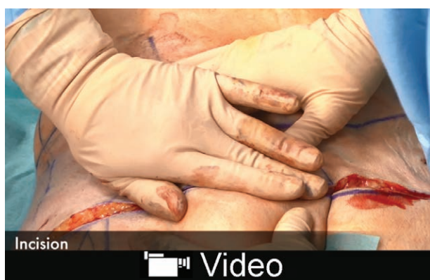
Video Graphic 2. See video, Supplemental Digital Content 2, which displays posterior contouring. This video is available in the “Related Videos” section of the Full-Text article on PRSGlobalOpen.com or available at http://links.lww.com/PRSGO/A996 .

the skin was removed just under the dermis with a careful conservation of the connective tissue, which contains microvessels. This tissue preservation allows a reduced dead space filled by a framework that may afford good physiologic preservation of the remaining tissue. Indeed, we have previously reported that in these connective tissues, the microvascular network and probably the microvasculature were partly preserved. 4 This is particularly important because in intact organs, fluid exchange occurs at this level. In our opinion, it is the conservation of this microvascular network that enables the diminution of postoperative complications and drainage duration. Wound closure is achieved through a flapness autoaugmentation 3 without drains by separated absorbable stitches using Polysorb 2 (Covidien, Dublin, Ireland) at the level of superficialis fascia between the inferior and the superior flap and by separated intradermal stitches using Monocryl 3/0 (Ethicon, Inc., Somers-