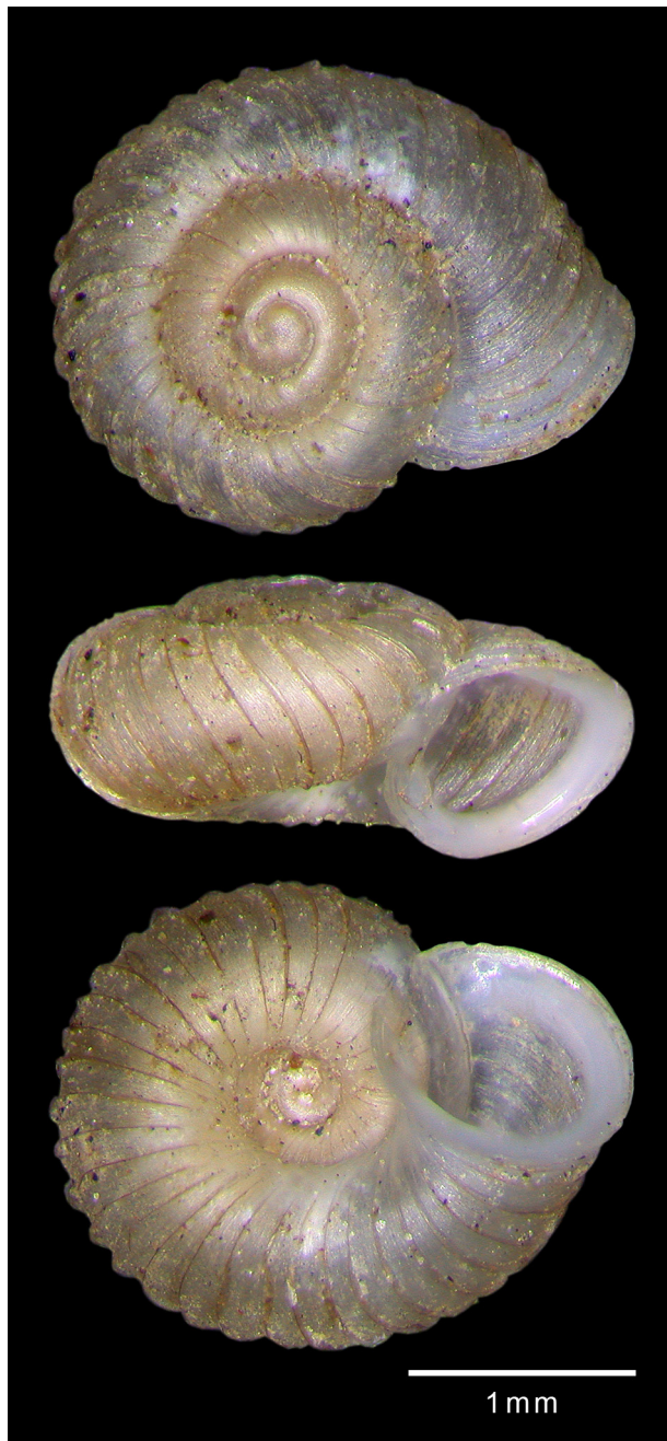
Figure 2. Vallonia costata , Kamloops, BC (NBM 010448).

Vallonia species, identifications by shell morphology and by barcoding were consistent. At within-species level the 2 individuals of V. costata from Kamloops slightly differ in their COI sequences, so they are not clones. Indeed, each individual clusters together with several individuals from Ontario.