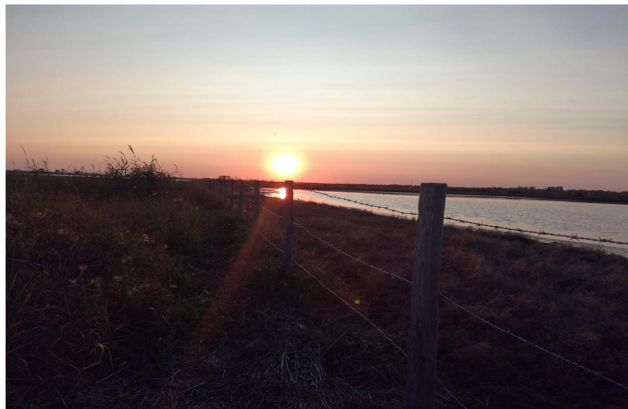
Image 1: Waterfowl hunting in the evening in front of a pond, Ile Pipy.