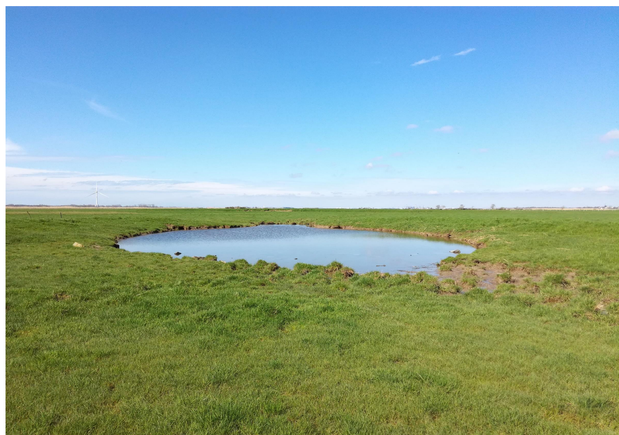
Image 2: Ile de Pierre-Rouge during the day with a pond, used for cattle and for waterfowl.