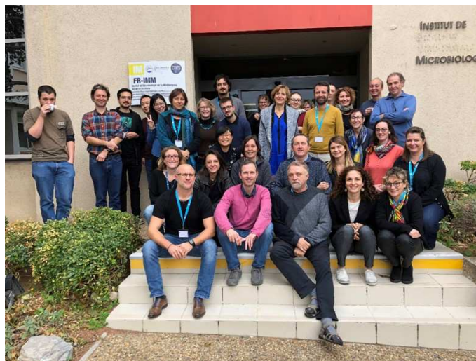
Figure 2: Group picture of the first French workshop on chaperone proteins and protein folding.