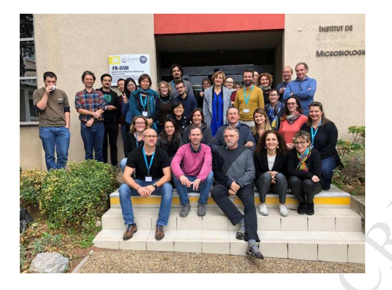
Figure 2: Group picture of the first French workshop on chaperone proteins and protein folding.