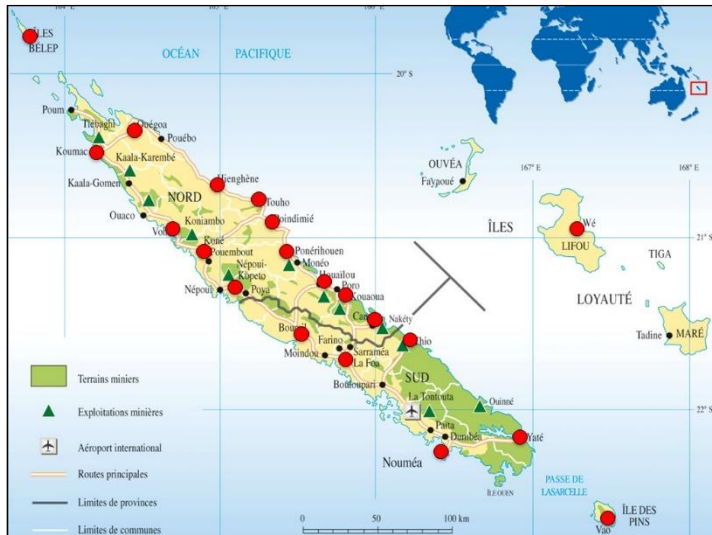
Figure 1. Map of New Caledonia showing recruitment sites, areas (NE, NW, SE, SW, Loyalty Islands) and ultramafic soils (in green). Adapted from: Carte des activités industrielles et des services de Nouvelle-Calédonie, éditions Hatier, Paris, 1990.

excluded participants with an incomplete questionnaire ( n = 3 ) or missing data for metal ( n = 11 ) or creatinine ( n = 1 ) concentrations, the analysis reported here included 731 participants.