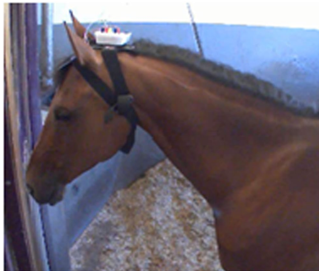
Figure 2. EEG device: headset placed on an attentive horse's head.

second visual artifact rejection procedure was performed to exclude potential remaining artefacts. A complex Fast-Fourier Transform (FFT) was applied on these 500 ms epochs. Given the difficulty to adequately identify the artifacts, for each frequency, outlying values \pm 3 SD were identified and the corresponding epoch were removed from the analysis. The FFT values for each horse were averaged separately for each session and the relative EEG power values (see also 47 ) of the alpha ( \alpha : 8–12 Hz), beta ( \beta : 12–30 Hz) and gamma ( \gamma : >30 Hz) frequency bands, characteristic of awake animals, were extracted. Wave percentage values were calculated as the proportion of the mean power values of these 3 wave types (alpha, beta and gamma).