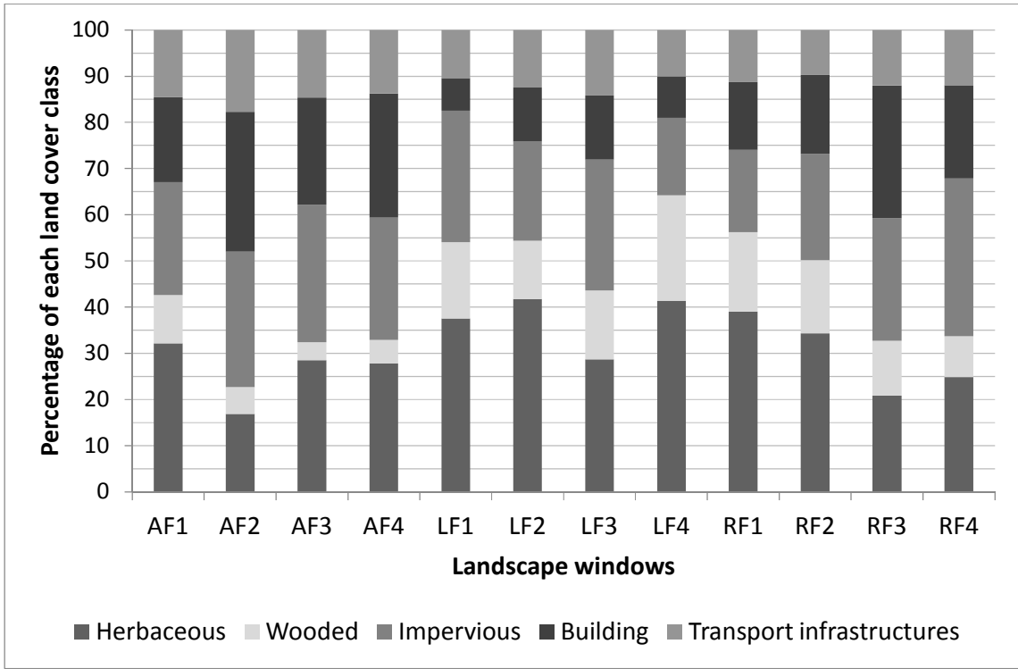
Figure 2: Percentage of each land cover class in the 12 landscapes. AF: Angers, LF: Lens, RF: Rennes.