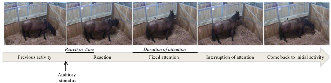
Figure 2. Detailed ethogram of horses' attention towards the auditory stimuli: a reaction was defined as any change in the ongoing activity or any body movement of ears, head, neck or all body. Attention was characterized by the horses standing with their body completely immobile and their fixed visual and auditory sensory organs ( i.e. use of their binocular visual field, pointing both ears towards the stimulus source) converging towards the stimulus. Interruption of attention towards the auditory distractors was indicated by the horse's ears or head starting to move and the horses came back to their initial activity. This detailed behaviours allow the measurement of the reaction time i.e. time between the auditory stimulus broadcast and the horse's first change in behaviour and the total duration of attention.