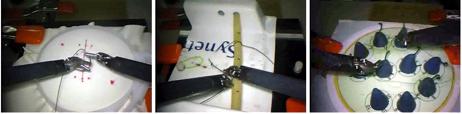
Fig. 2: Snapshots of the three surgical tasks in the JIGSAWS dataset (from left to right): suturing, knot-tying, needle-passing [7].

In order to classify an unlabeled kinematic data, the method transforms it into a terms frequency vector using exactly the same sliding window and SAX parameters used for the training part. It computes the cosine similarity measure (Eq. 4) between this term frequency vector and the N tf*idf weight vectors representing the training classes. The unlabeled kinematic data is assigned to the class whose vector yields the maximal cosine similarity value.