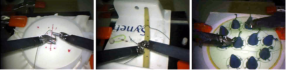
Fig. 2: Snapshots of the three surgical tasks in the JIGSAWS dataset (from left to right): suturing, knot-tying, needle-passing [7].

In order to classify an unlabeled kinematic data, the method transforms it into a terms frequency vector using exactly the same sliding window and SAX parameters used for the training part. It computes the cosine similarity measure (Eq. 4) between this term frequency vector and the N tf-idf weight vectors representing the training classes. The unlabeled kinematic data is assigned to the class whose vector yields the maximal cosine similarity value.