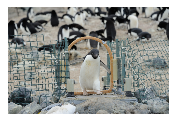
Figure 2. Adélie penguins are identified and weighed each time they cross the automated weighbridge on their way to/from the sea. doi:10.1371/journal.pone.0085291.g002

that we obtained, these results will need to be confirmed by further studies