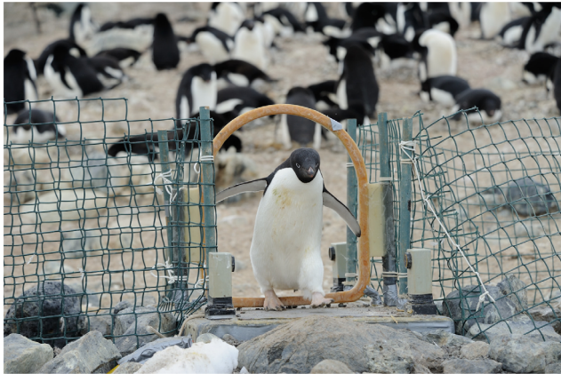
Figure 2. Adélie penguins are identified and weighed each time they cross the automated weighbridge on their way to/from the sea. doi:10.1371/journal.pone.0085291.g002

that we obtained, these results will need to be confirmed by further studies.