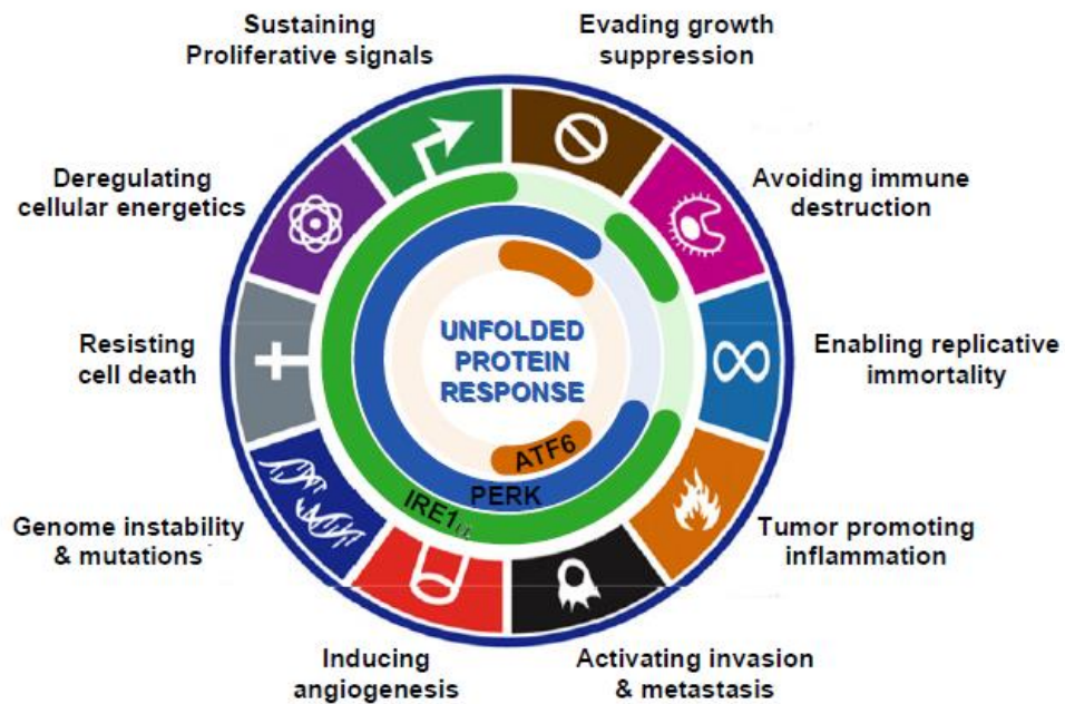
Figure 3. ER stress and the hallmarks of cancer.

Cancer cells acquire several features that allow disease progression. The Unfolded protein response (UPR) is involved in most hallmarks of cancer [1]. Activating transcription factor 6 (ATF6) is mostly linked to metastasis and dormancy; however, Inositol-requiring enzyme 1 (IRE1 \alpha ) signaling has been linked to most hallmarks except tumor dormancy. Data available suggests that the PKR-like ER kinase (PERK) pathway has a more diverse functions in processes related to tumor growth and cancer progression.