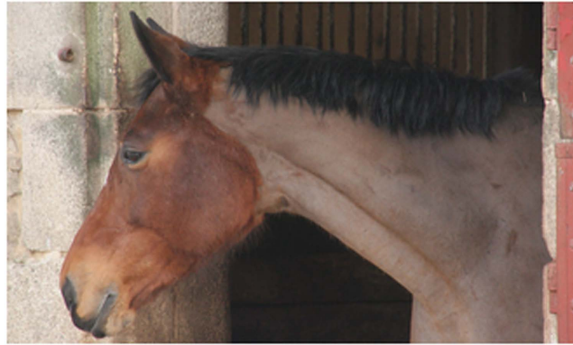
Figure 1. Attention or monitoring behaviour in horses is characterized by standing motionless at the stall door, with their neck horizontal or slightly elevated, ears and neck mobile, and slowly scanning their environment by moving their head laterally or occasionally gazing for a short moment at environmental stimuli.