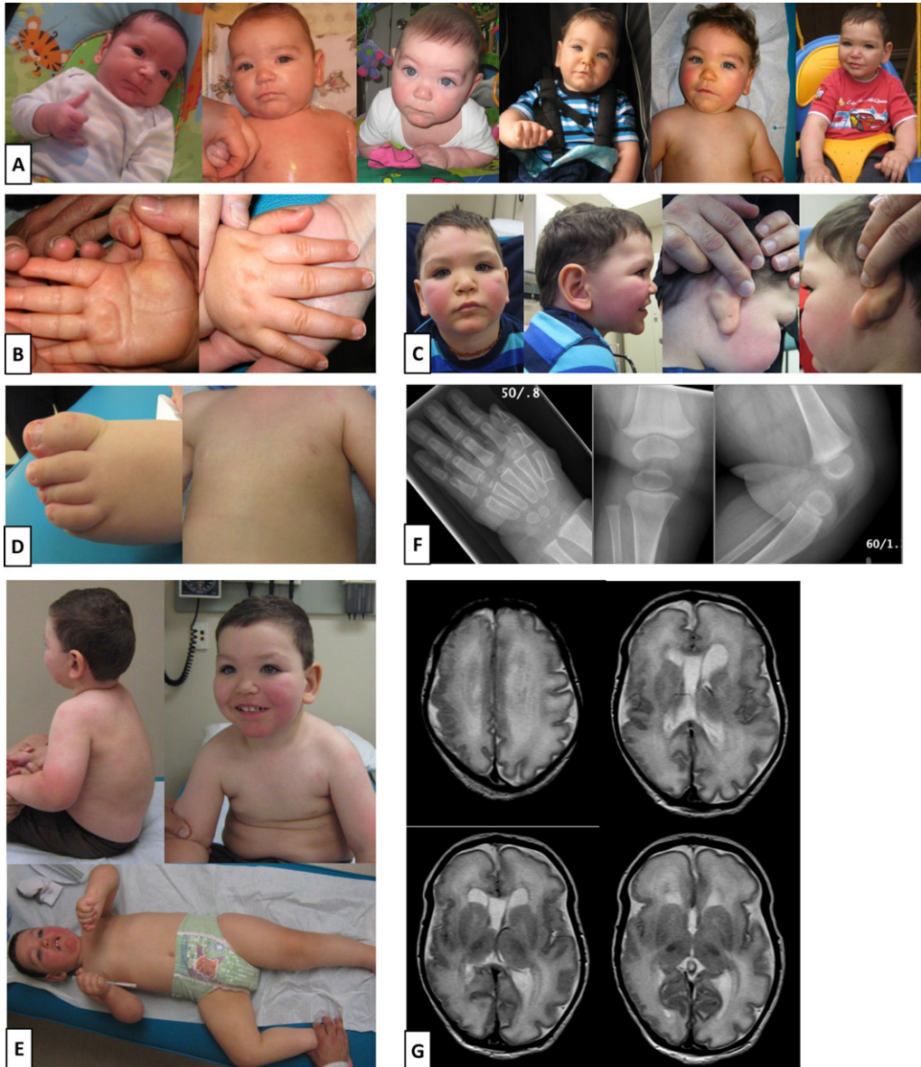
Figure 1. Weaver syndrome proband with polymicrogyria described in this study. A: Proband 5 is shown at 2, 4, 6, 8, 12, and 19 months. B: Both sides of the hand are shown at 12 months to illustrate the prominent palmar crease. C: At 27 months, face with prominent rosy cheeks, profile and ears are shown to confirm the dimple is only present behind the right ear. D: At 31 months, mild camptodactyly is seen on the toes and a third nipple is apparent. E: Full torso and full body are also shown at 31 months. F: X-rays of the hand at 11½ months and the knee at 10½ months are indicative of advanced bone age. G: MRI done at 5 days of age illustrates asymmetric perisylvian polymicrogyria.

[Freeman et al., 1999; Al-Salem et al., 2013]. In each previous case, and in our case, there was asymmetric perisylvian polymicrogyria that appeared more severe on the right side, as well as mildly enlarged lateral ventricles. The report by Freeman et al. (1999) described pachygyria, but based on review of the published images (W. Dobyns), we believe the findings are more consistent with perisylvian polymicrogyria. The image shown in the report by Al-Salem et al. (2013) demonstrates enlarged extra-axial fluid spaces over the brain, similar in appearance to the polymicrogyria observed among megalencephaly syndromes associated with PI3K-AKT pathway mutations [Mirzaa et al., 2012]. However, neither hydrocephalus nor Chiari malformations were seen in these WS patients. Tatton-Brown et al. (2013) also reported a case with pachy- and polymicrogyria, but no images were published.