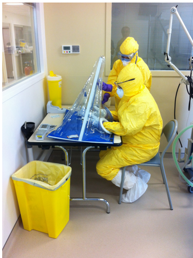
Fig. 4. The Captair Field Pyramid ® used for blood tests.

haemorrhagic risk. Secondly, all EVD care must be performed under a benefit/risk balance.