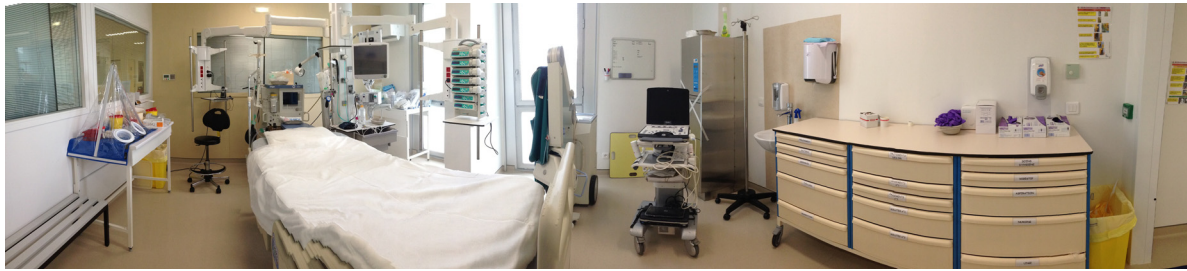
Fig. 6. Organization of the ICU room at the Begin Military Hospital with dedicated devices.

orders. For our part, we are following the 2010 recommendations of the French ICU Society [26].