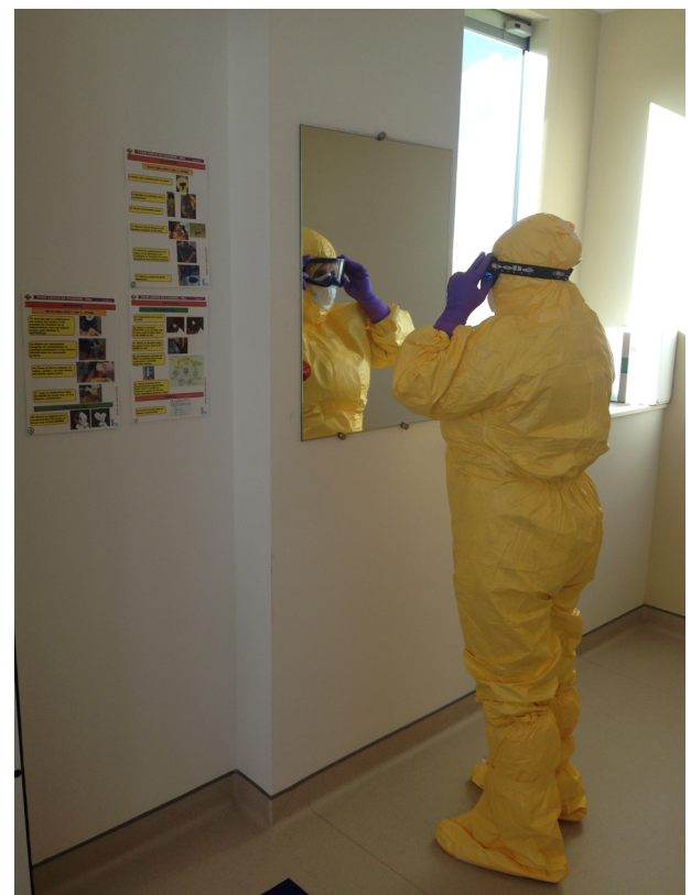
Fig. 2. Personal check during undressing.

To be able to safely take care of an agitated patient without any venous access, we decided to have a sedative gas ready in the room. The latter can be a nitrous oxide cylinder, or if not available, an anaesthesia workstation for using inhaled anaesthetics. The