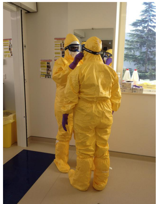
Fig. 1. Staff's training session to dress in personal protective equipment (PPE).

In the ICU, physical barriers must be in place to prevent visitors or unprotected staff from accessing the high-risk area. This high-risk area should be clearly marked out using coloured panels and stickers. Three kinds of area can be differentiated within the unit (Table 1). There are no clear recommendations concerning the organization of the patient's room, but the following conclusions can be drawn from knowledge from Biosafety Level-4 (BSL-4) laboratories [14]: rooms should be maintained under continuous negative pressure with an increasing pressure gradient from the airlock to the patient room. If possible, the room must include a one-way access or keep forward access. If not possible, a dressing room should be provided close to the patient's room and the