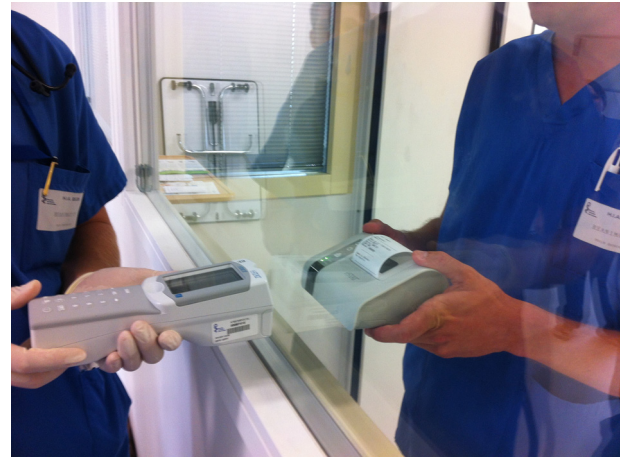
Fig. 3. How to print blood results.

We used a point-of-care test for paludism: Palutop + 4 Optima® (Alldiag, CS 28006-67038 Strasbourg cedex, France), which allow diagnosis of the four plasmodium species. The use of this test is quite easy and a single training episode for the staff has been judged sufficient.