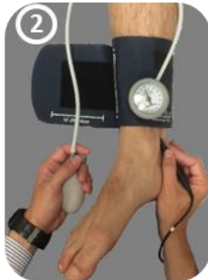
Right posterior tibial (PT) artery