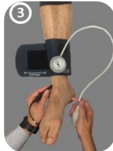
Right dorsalis pedis (DP) artery