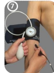
Right brachial artery