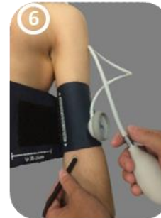
Left brachial artery