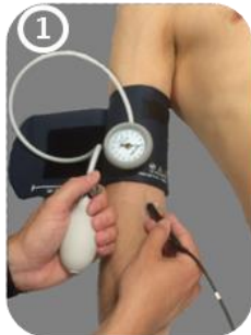
Right brachial artery