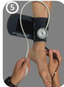
Left dorsalis pedis (DP) artery