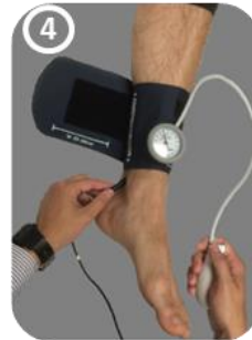
Left posterior tibial (PT) artery