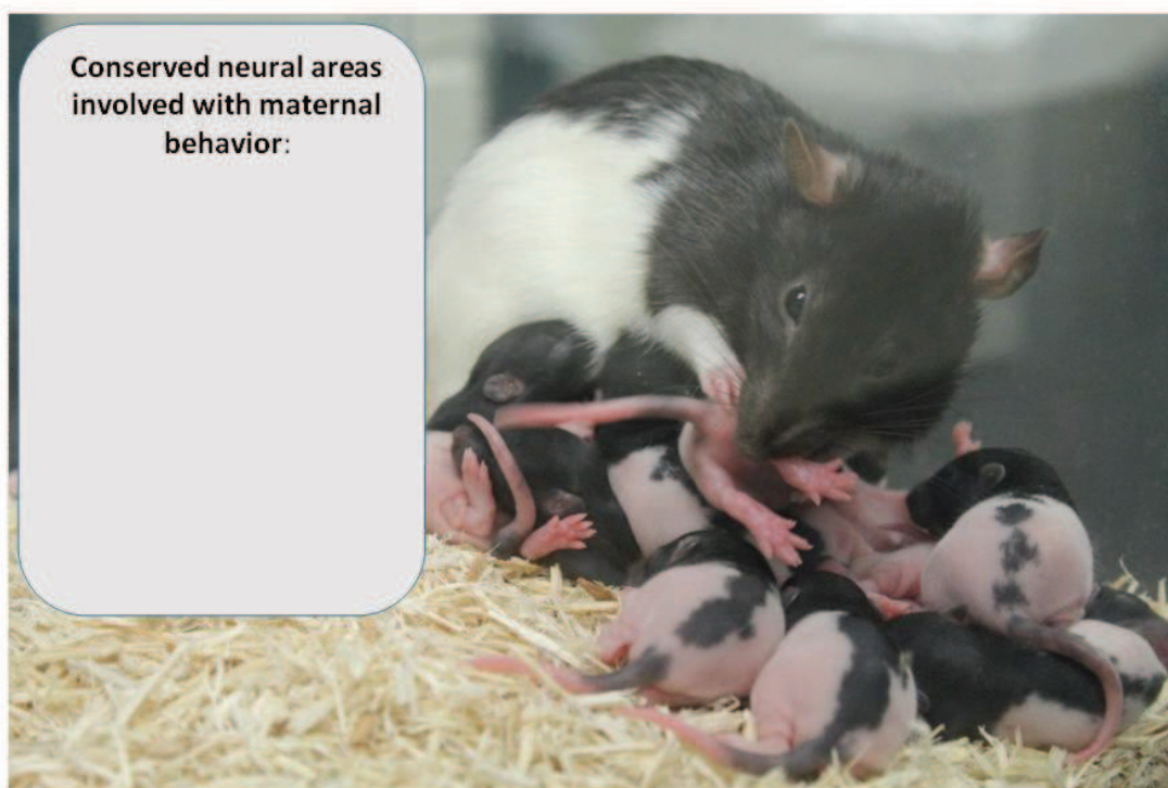
Figure 3. Conserved maternal neural areas. In addition to the areas listed in the figure that have been conserved in both animal and human models, human fMRI studies have identified a functional role for the medial prefrontal cortex, insula, ventral striatum and thalamus in the production and maintenance of maternal behavior.