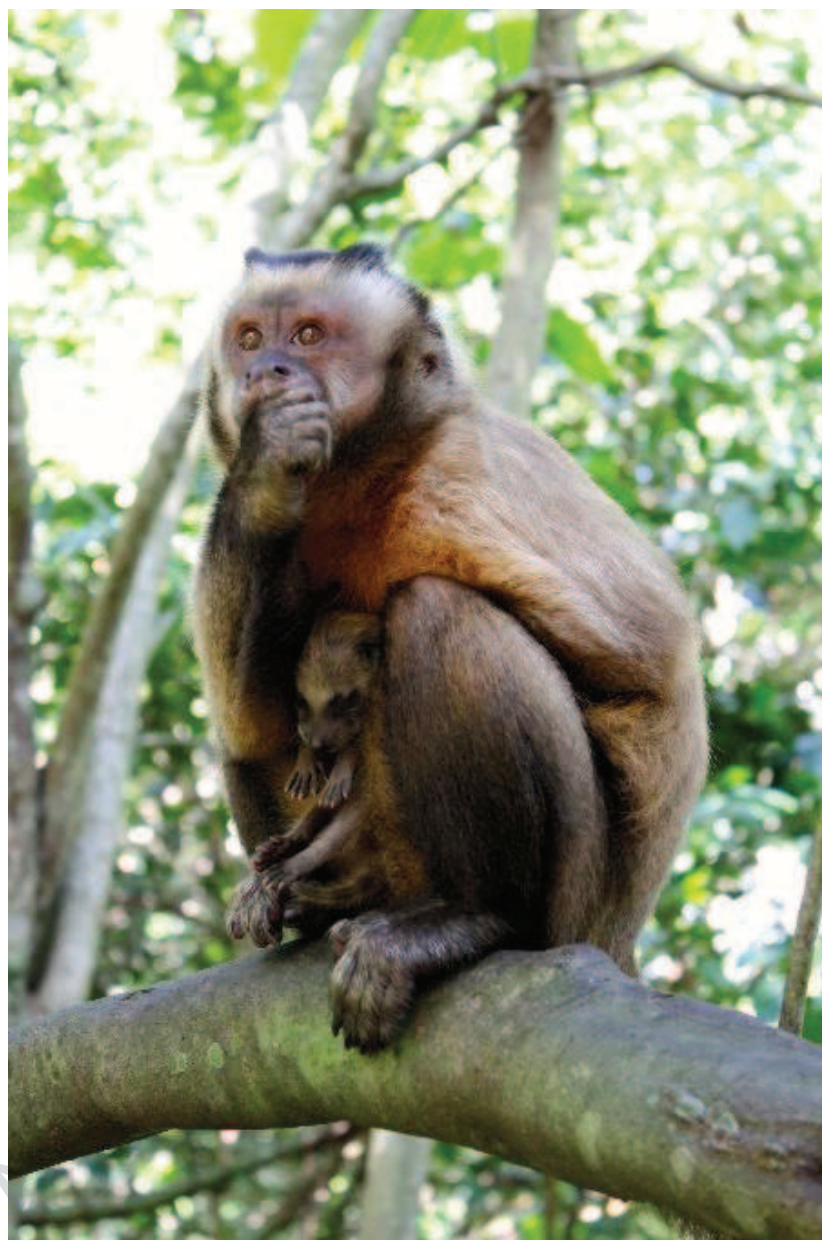
Figure 1. Contraspecific maternal motivation. Semi-free ranging capuchin female carrying a raccoon kit after abducting it from its natural mother.