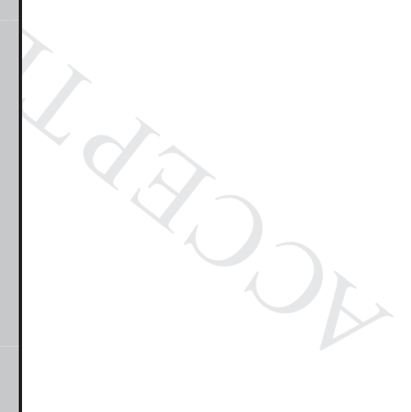
Table 2. Strictures characteristics. CD, Crohn's disease; UC, Ulcerative colitis.

p=0.032 ns ns ns ns 3 (0.6-9.6) UC (n=39) 5 (4-10) 60% 38% 6% 13% 62% 19% 6.3 (1.6-20) CD (n=248) 6 (4-10) 73% 33% 16% 14% 64% 6% Median stricture duration at Right colon Transv. colon Left colon Rectal Length (cm, Q1-Q3) Symptomatic (%) surgery (months) Passable (%) Location