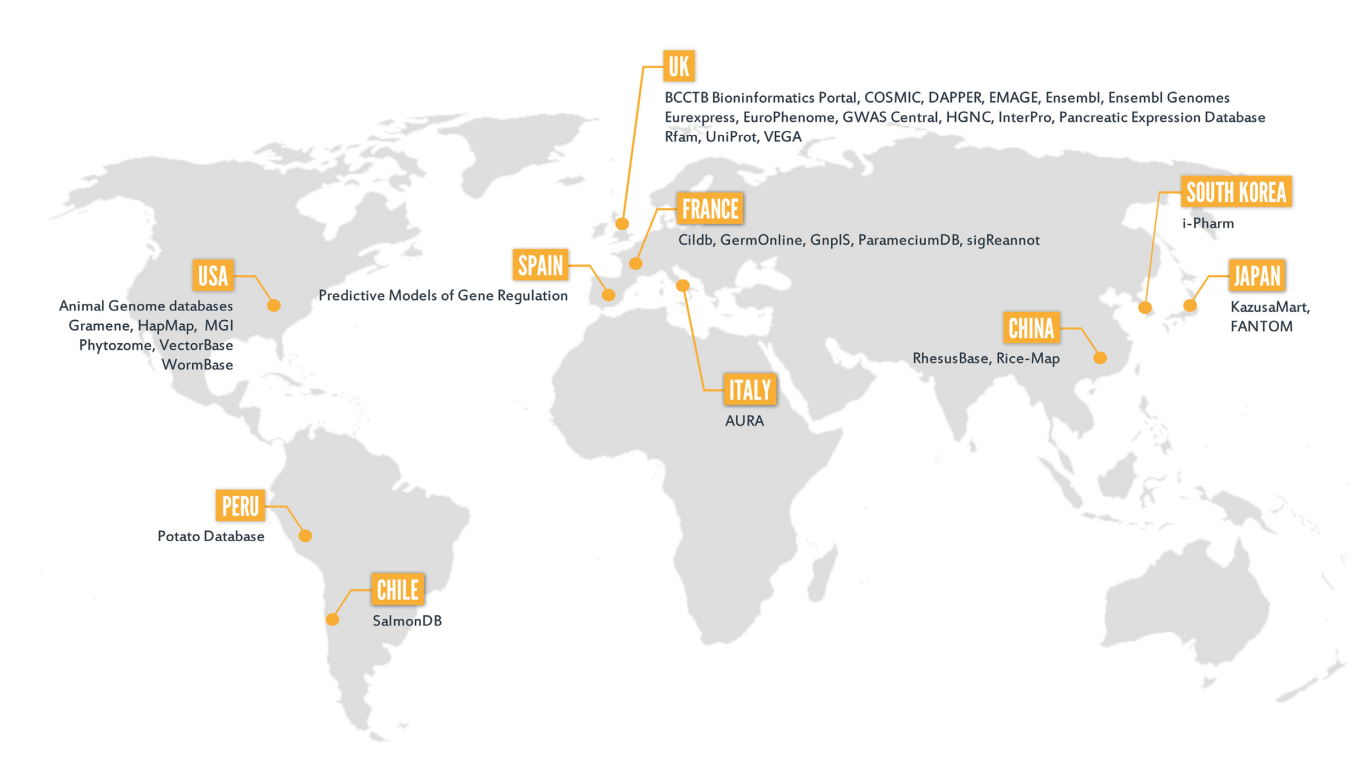
Figure 1. BioMart community databases and their host countries.

ing results from a few existing resources is challenging due to the lack of a complete, up to date catalogue of already existing resources and the necessity of constantly learning how to navigate new query interfaces. A different challenge is faced by collaborating groups of scientists who independently generate or maintain their own data. Such collaborations are seriously hampered by the lack of a simple data management solution that would make it possible to connect their disparate, geographically distributed data sources and present them in a uniform way to other scientists. The BioMart project has been set up to address these challenges.