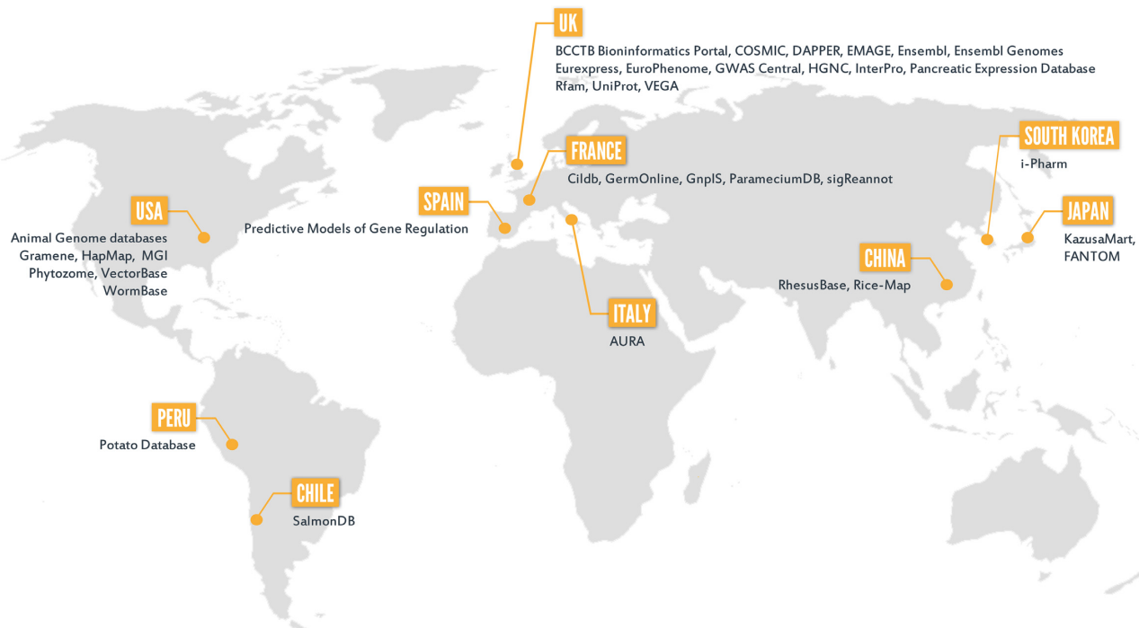
Figure 1. BioMart USA community databases and their host countries.

ing results from a few existing resources is challenging due to the lack of a complete, up to date catalogue of already existing resources and the necessity of constantly learning how to navigate new query interfaces. A different challenge is faced by collaborating groups of scientists who independently generate or maintain their own data. Such collaborations are seriously hampered by the lack of a simple data management solution that would make it possible to connect their disparate, geographically distributed data sources and present them in a uniform way to other scientists. The BioMart project has been set up to address these challenges.