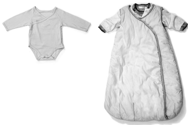
Figure 1 | Pictures of both types of clothing. Left-hand side: a baby bodysuit; right-hand side: pyjamas covered with a cardigan and a baby sleep-sack.

Following premature birth, NB experience a whole new set of sensory perceptions including strong constraints on their motor capacities limiting their movements and thereby the opportunity to self-explore 19 . Furthermore, the usual NICU environment subjects preterms to intense stimulations of their immature auditory and visual systems whereas their tactile and proprioceptive systems receive minimal input 20 . Contacts received by full-term NB through skin-to-skin (or kangaroo care) procedures have a soothing effect on a short-term basis with a decrease or an absence of cries compared to physical separation from their parents (mother: 21 ; father: 22 ). Positive long-term effects of skin-to-skin contacts given to preterm NB have