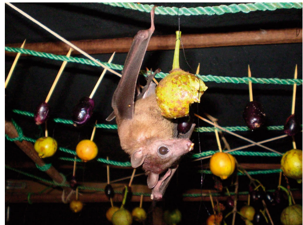
Fig. 1. Rousettus madagascariensis . Flight cage with a fruit bat feeding on a Ficus polita fruit.

that for 2 bats. We used 2 to 4 bats in the flight cage during 27 sessions over 4 consecutive months. Bats were offered 2 to 5 ripe fruit species each month depending on fruiting phenology. Four fruit species were offered at the same time in January, 2 in February, 5 in March and 3 in April. Fruits were impaled on toothpicks or spikes and hung from the roof of the cage, 15 cm apart, from 5 to 7 horizontal nylon ropes (Fig. 1). The bats were over-supplied with fruits, so that they would exercise choice and not be solely motivated by hunger.