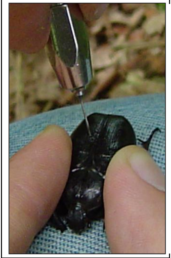
Figure 3: Marking of an individual on the elytra with a drill