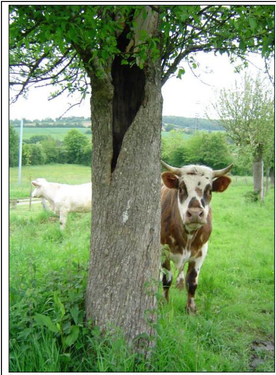
Figure 1: Malus hollow tree in Orne