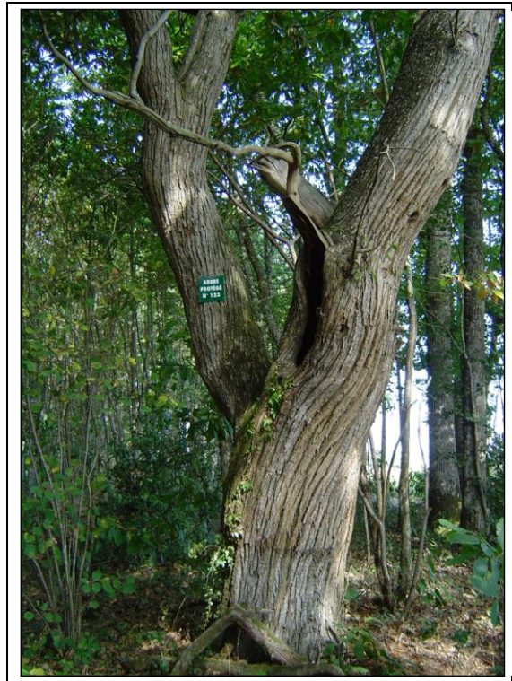
Figure 2: Castanea hollow tree in Sarthe