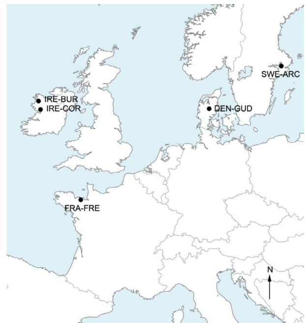
Figure 1. Geographical position of the sample sites of Anguilla anguilla in northern Europe: Burrishoole (IRE-BUR) and Corrib (IRE-COR) in Ireland, Frémur in France (FRA-FRE), Gudena in Denmark (DEN-GUD), and Stockholm Archipelago in Sweden (SWE-ARC).

spawning grounds and to reproduce in the Sargasso Sea compared to the most heavily infected ones.